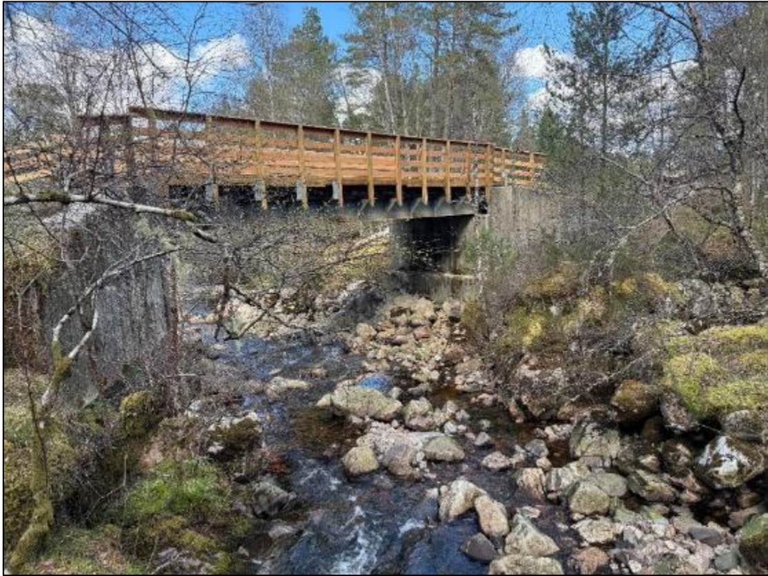
Figure A14. Photograph of stream crossing 14. Looking downstream.