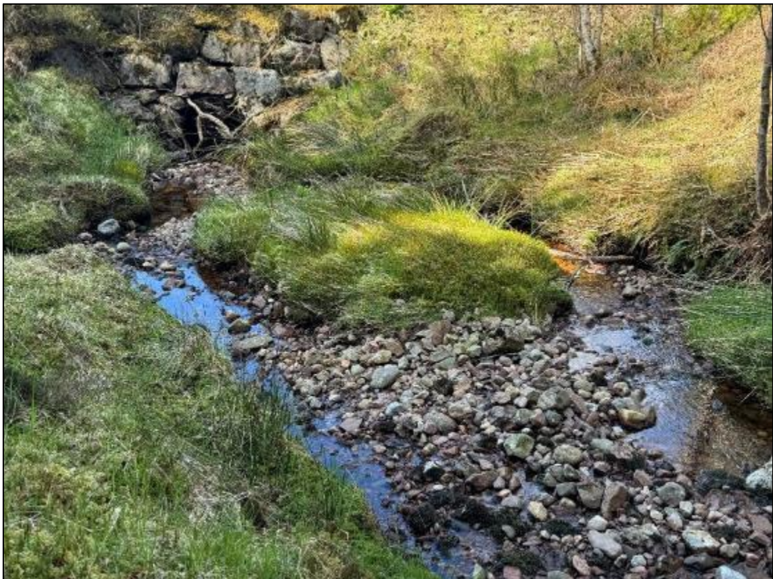
Figure A19. Photograph of stream crossing 19. Culvert entrance.