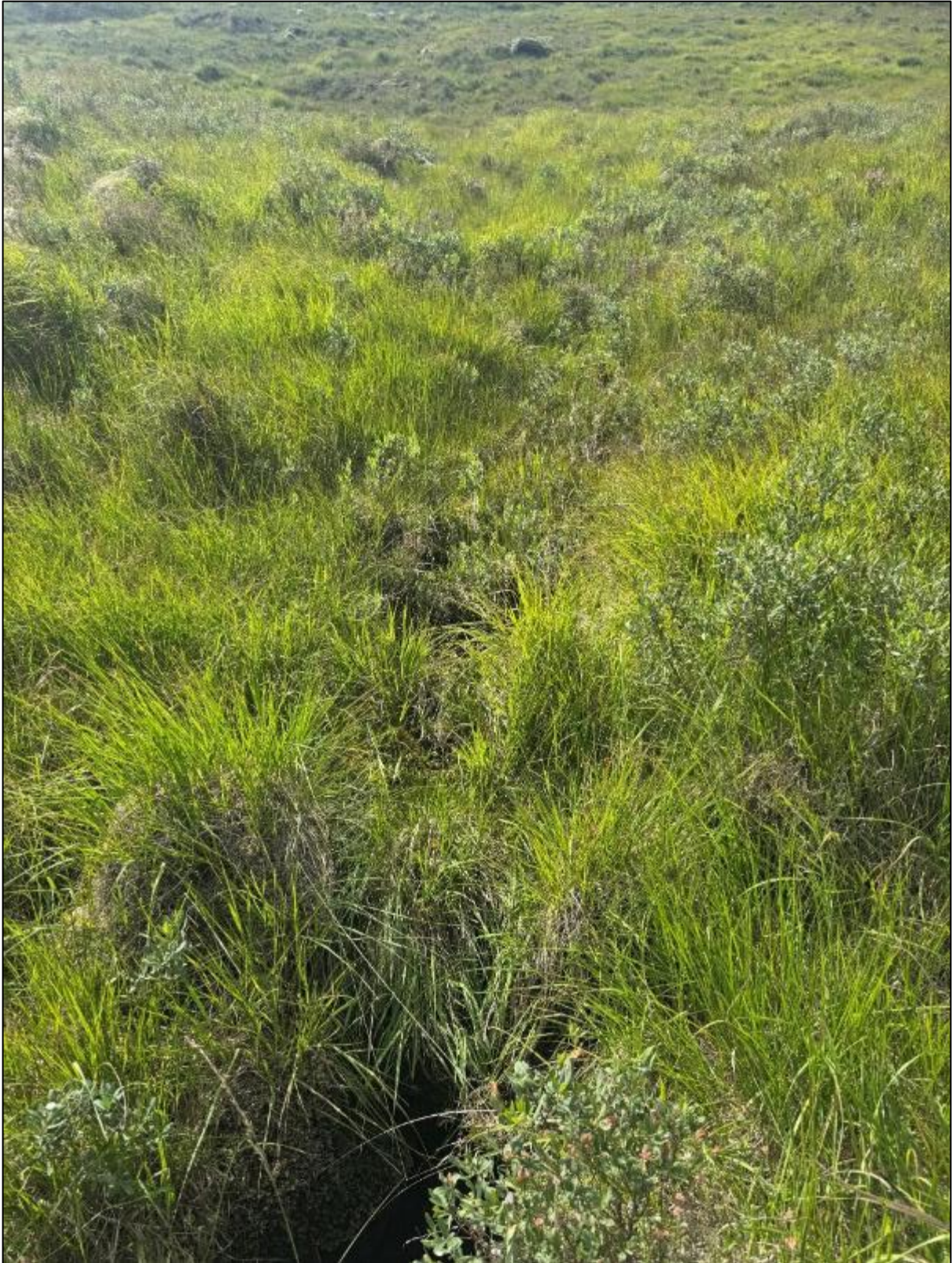
Figure A45. Photograph of proposed stream crossing 45 (no culvert at present). Looking upstream.