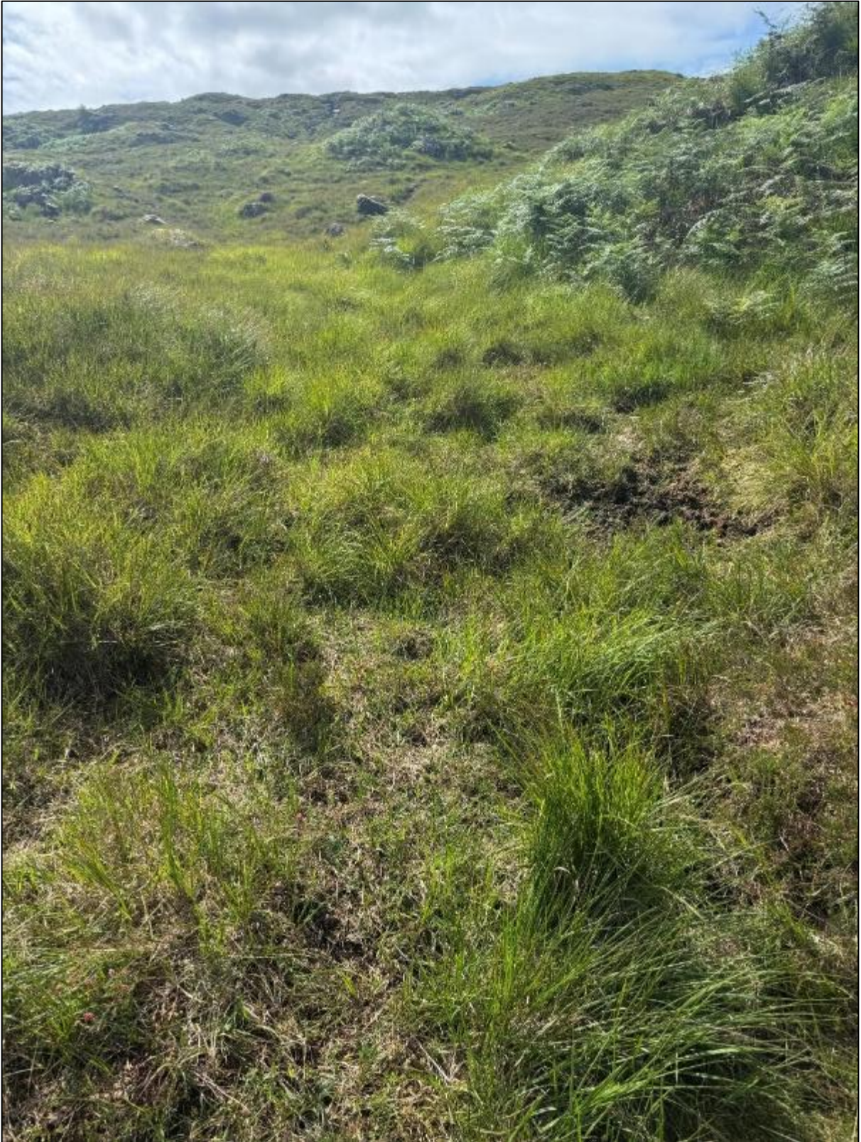
Figure A43. Photograph of proposed stream crossing 43 (no culvert at present). Looking upstream.