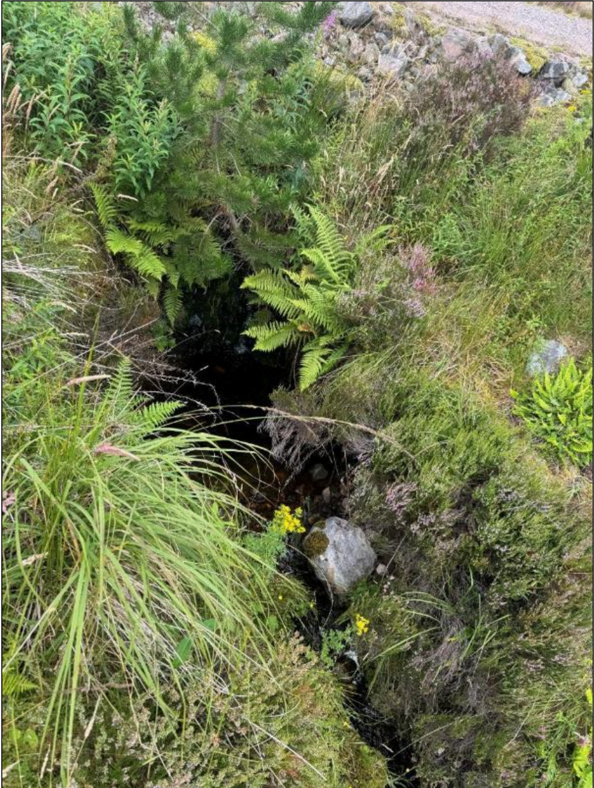
Figure A29. Photograph of stream crossing 29. Culvert entrance.