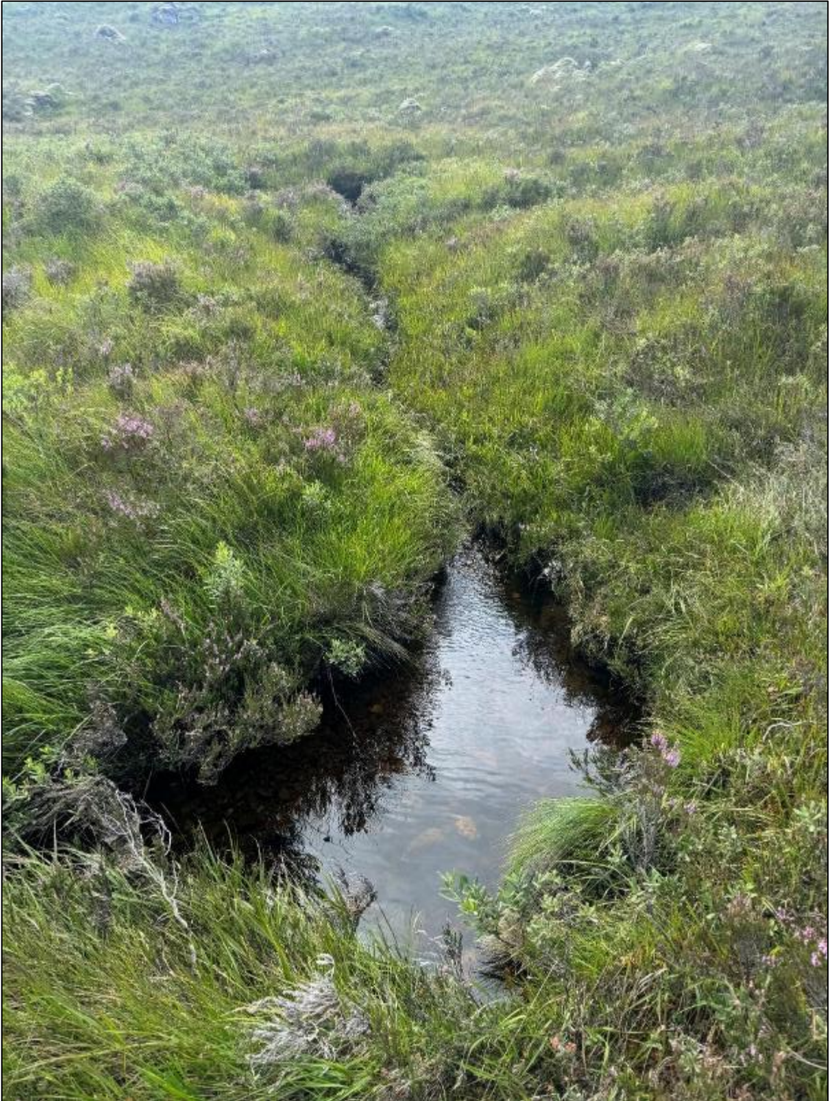
Figure A47. Photograph of proposed stream crossing 47 (no culvert at present). Looking upstream.