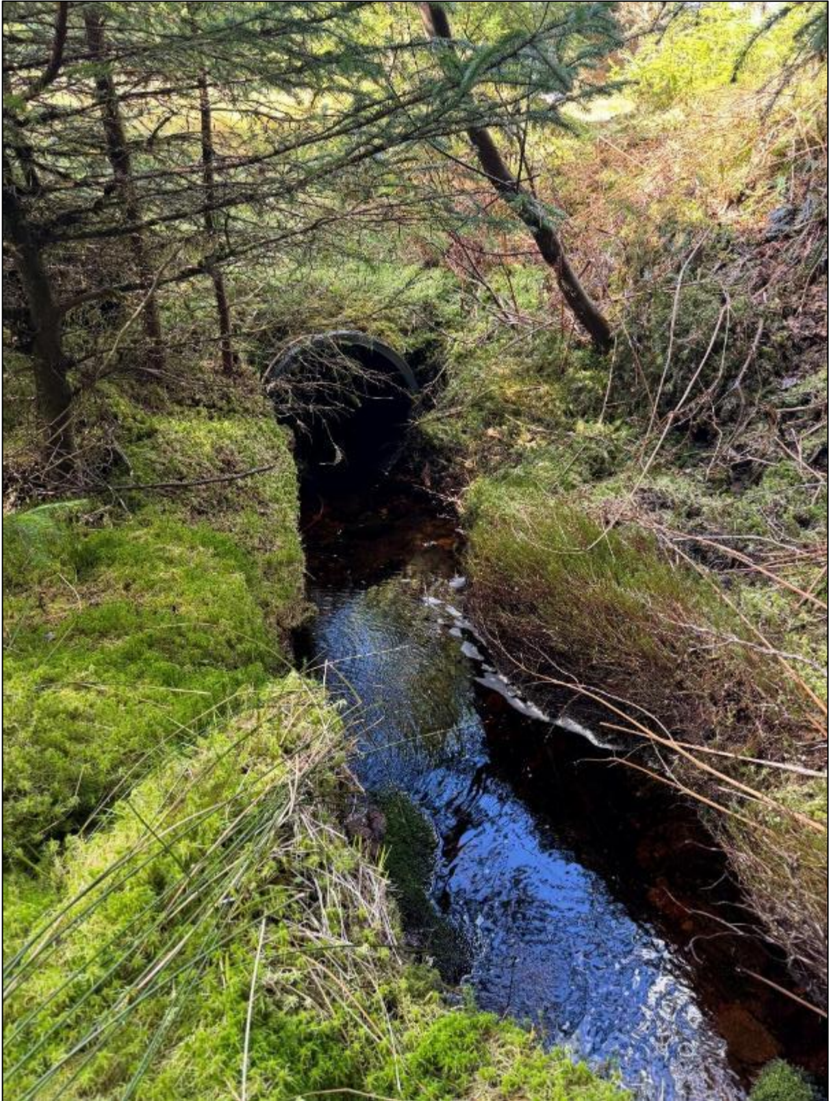
Figure A21. Photograph of stream crossing 21. Culvert entrance.