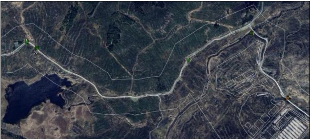
Figure 9. Location of stream crossings 29 to 31 (refer to Table 2 and point 8).