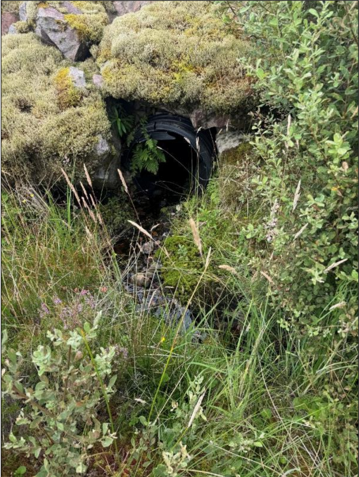
Figure A30. Photograph of stream crossing 30. Culvert entrance.