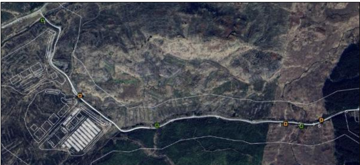
Figure 3. Location of stream crossings 1 to 6 (refer to Table 1 and point 8).