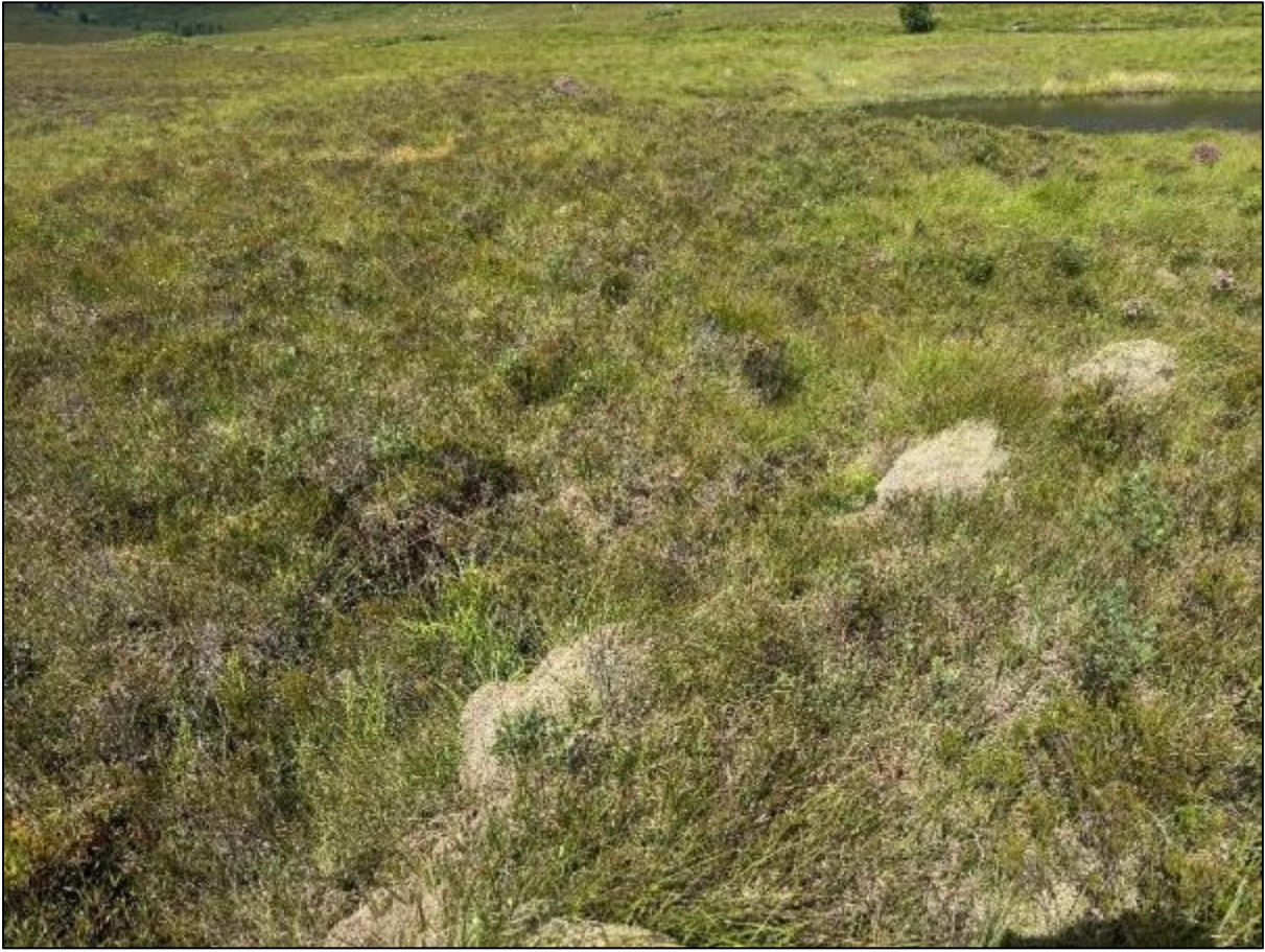
Figure A48. Photograph of proposed stream crossing 48 (no culvert at present). Looking downstream.