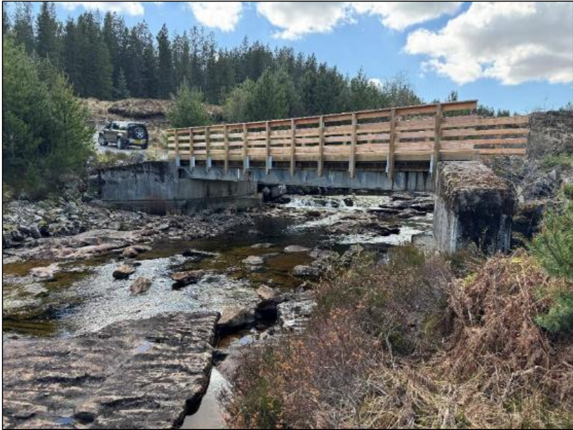
Figure A9. Photograph of stream crossing 9. Looking upstream.