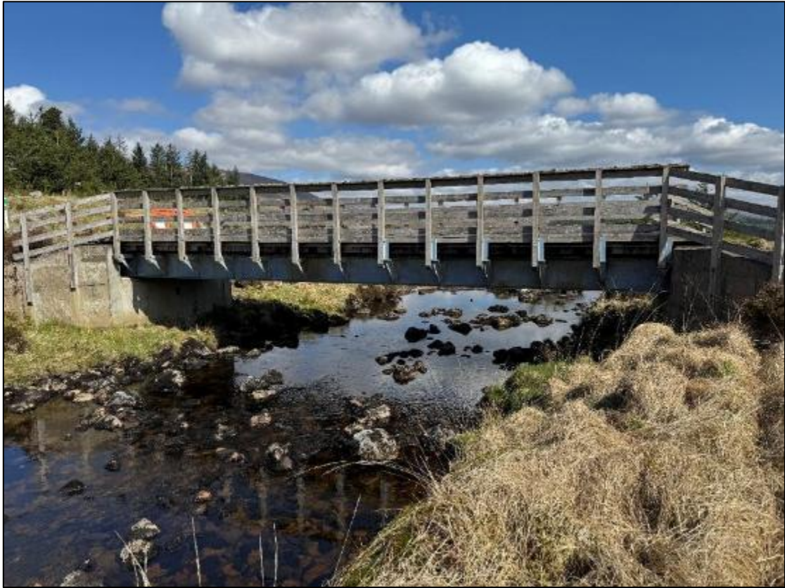
Figure A1. Photograph of stream crossing 1. Looking downstream.