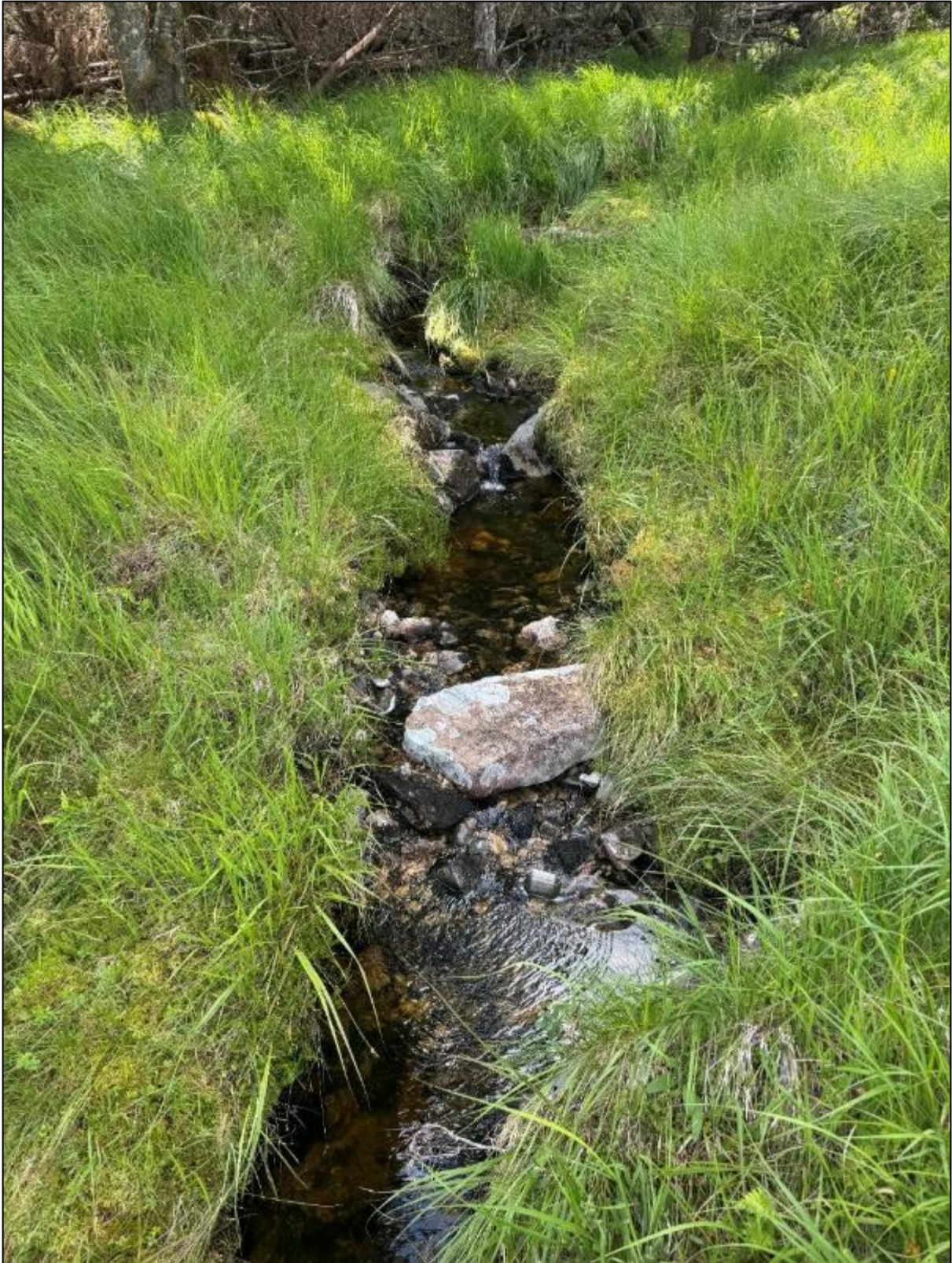
Figure A42. Photograph of proposed stream crossing 42 (no culvert at present). Looking upstream.