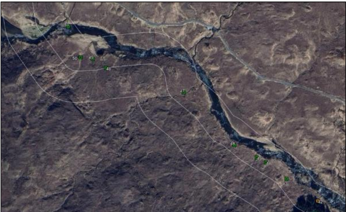
Figure 12. Location of stream crossings 42 to 51 (refer to Table 2 and point 8).