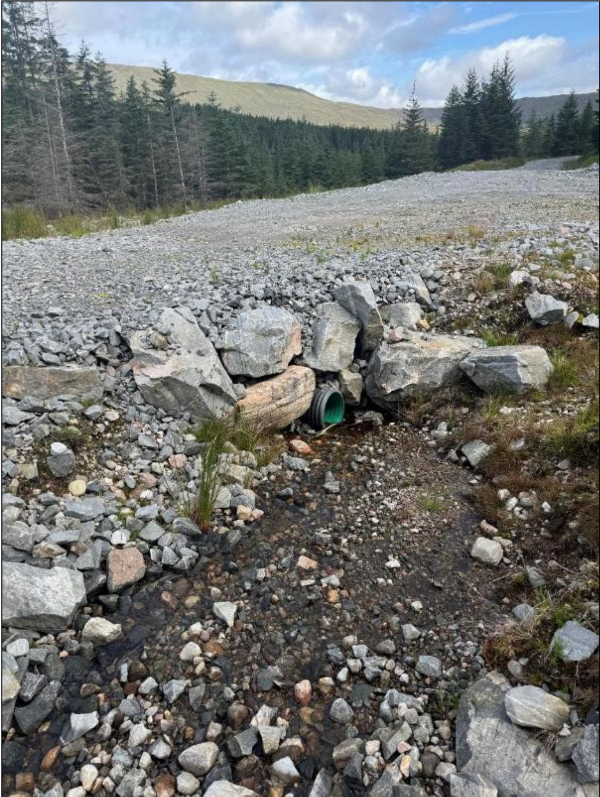
Figure A40. Photograph of stream crossing 40. Culvert entrance.