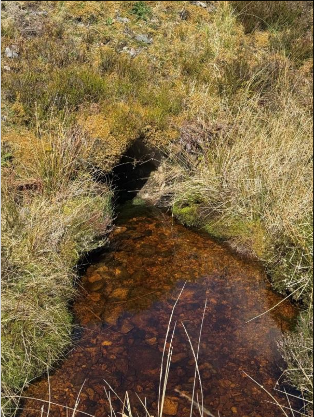
Figure A17. Photograph of stream crossing 17. Culvert entrance.