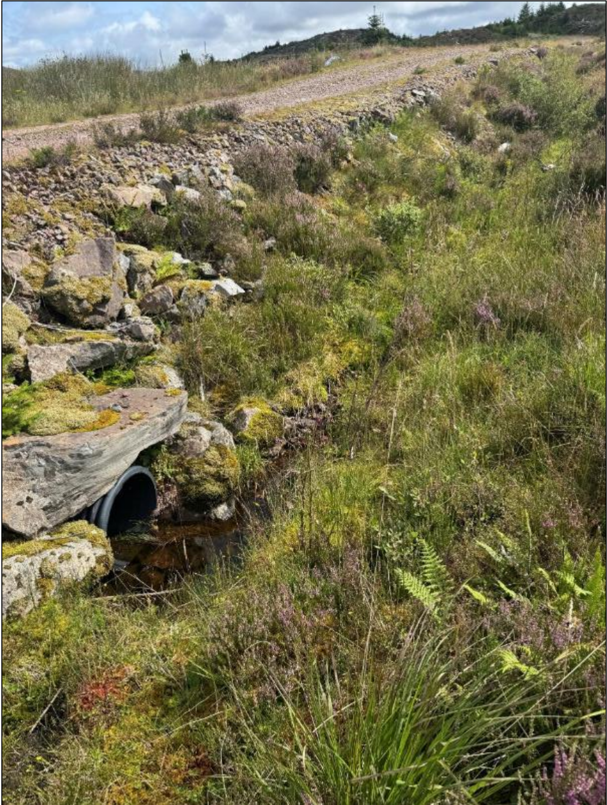
Figure A34. Photograph of stream crossing 34. Culvert entrance.