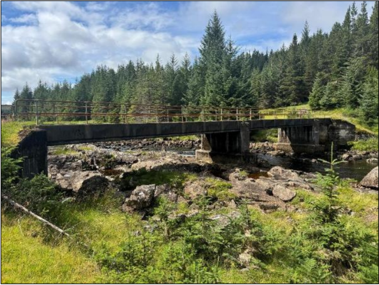
Figure A41. Photograph of stream crossing 41. River Kingie, looking upstream.