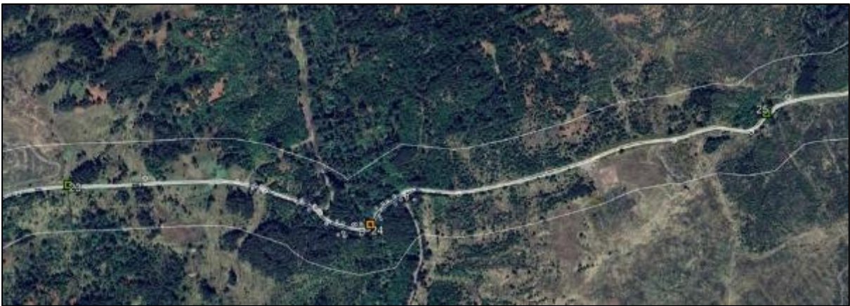
Figure 7. Location of stream crossings 23 to 25 (refer to Table 1 and point 8).