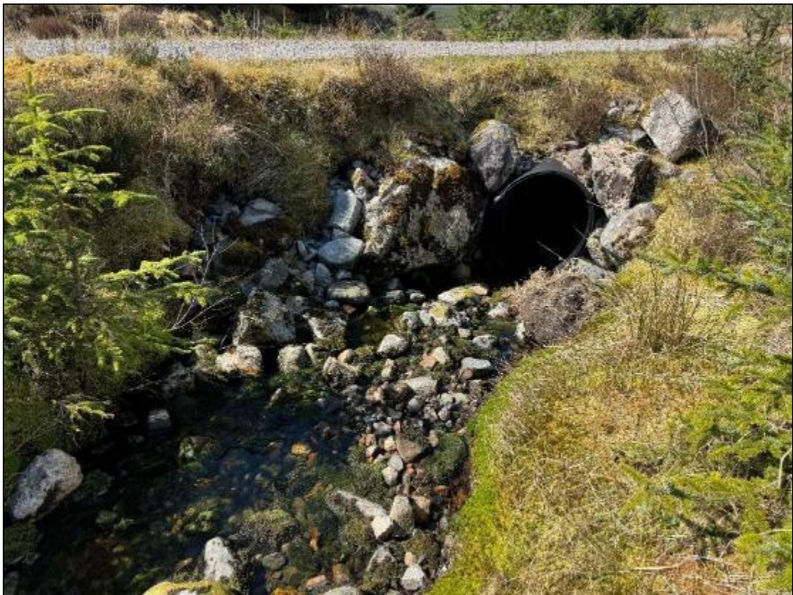
Figure A2. Photograph of stream crossing 2. Culvert entrance.