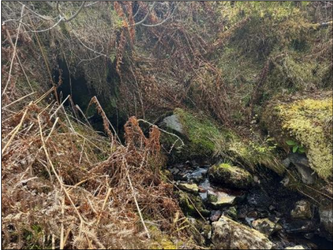
Figure A27. Photograph of stream crossing 27. Culvert outfall.