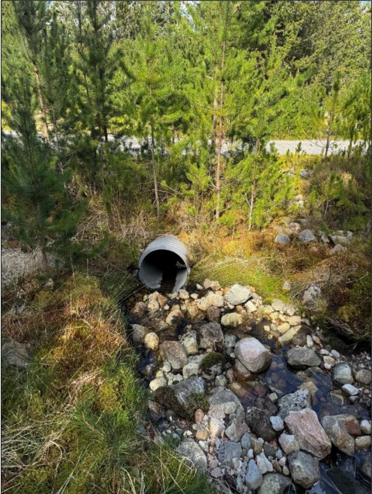
Figure A7. Photograph of stream crossing 7. Culvert outfall.