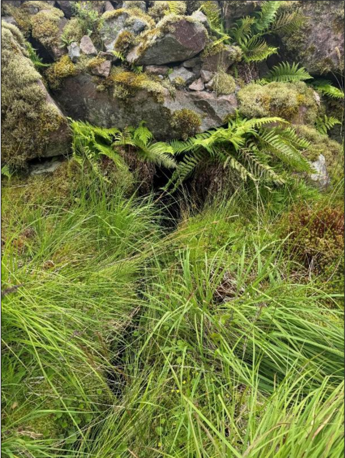
Figure A31. Photograph of stream crossing 31. Culvert outfall.