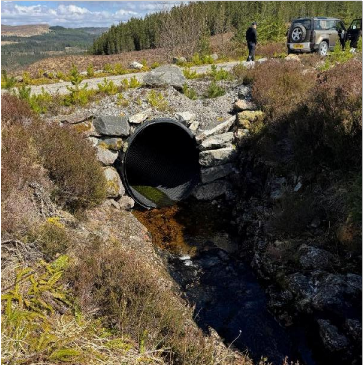
Figure A5. Photograph of stream crossing 5. Culvert entrance.