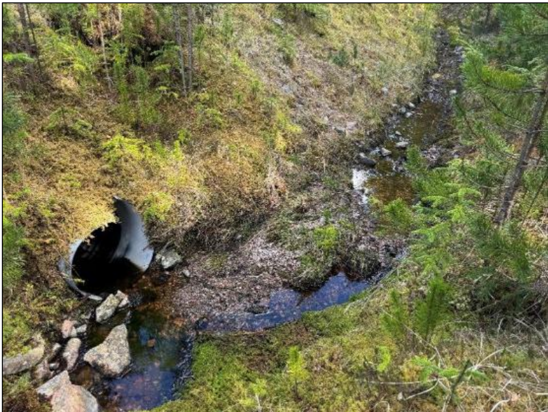
Figure A10. Photograph of stream crossing 10. Culvert entrance.