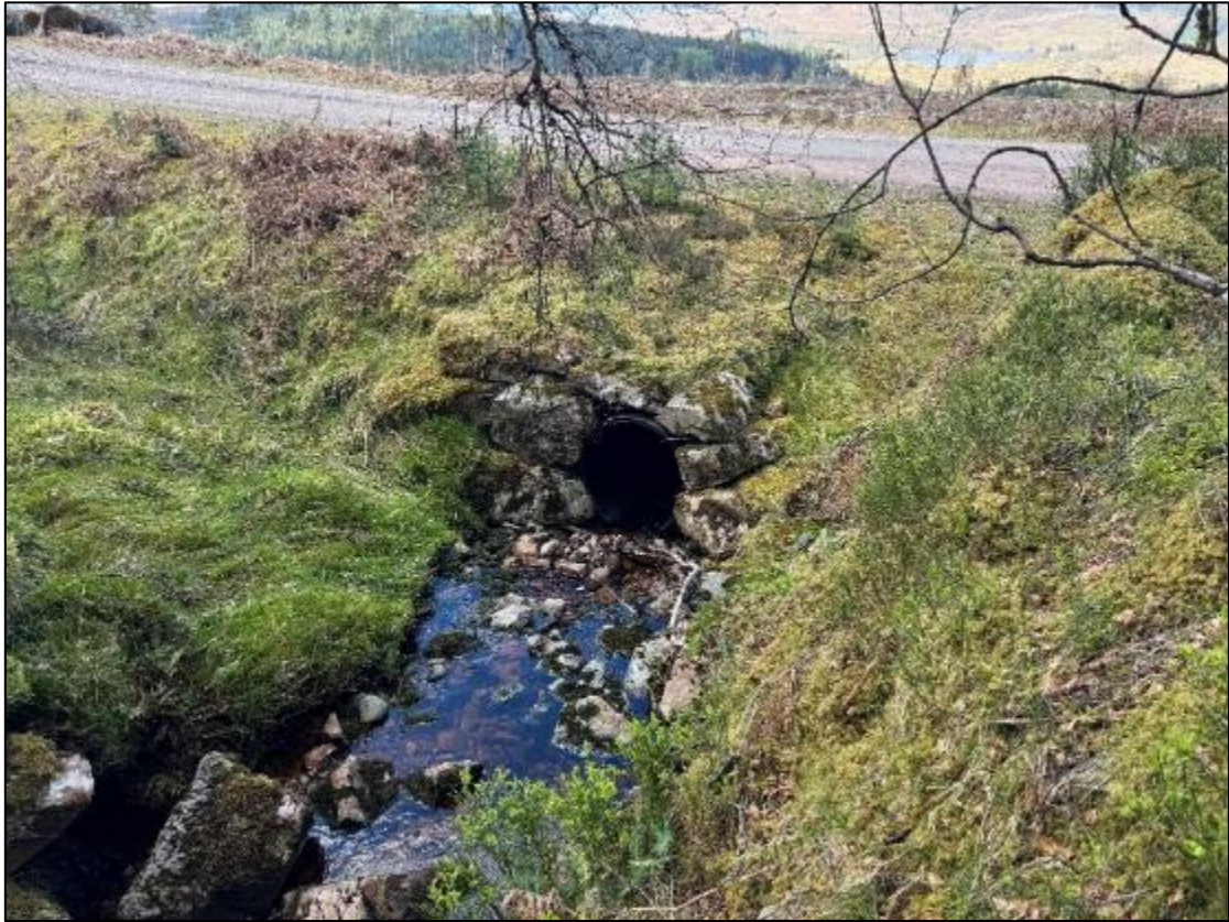
Figure A18. Photograph of stream crossing 18. Culvert entrance.