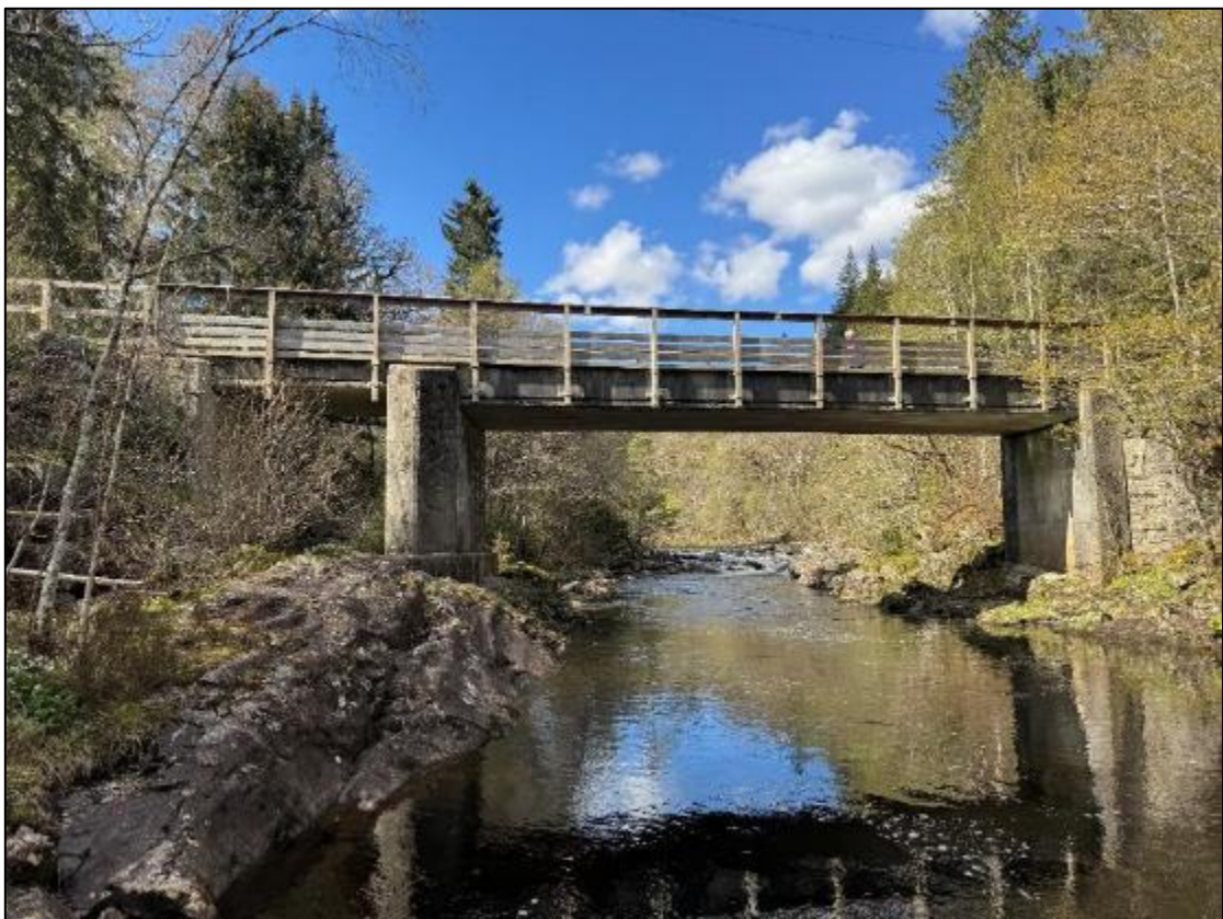
Figure A28. Photograph of stream crossing 28 (White Bridge over River Garry). Looking upstream.