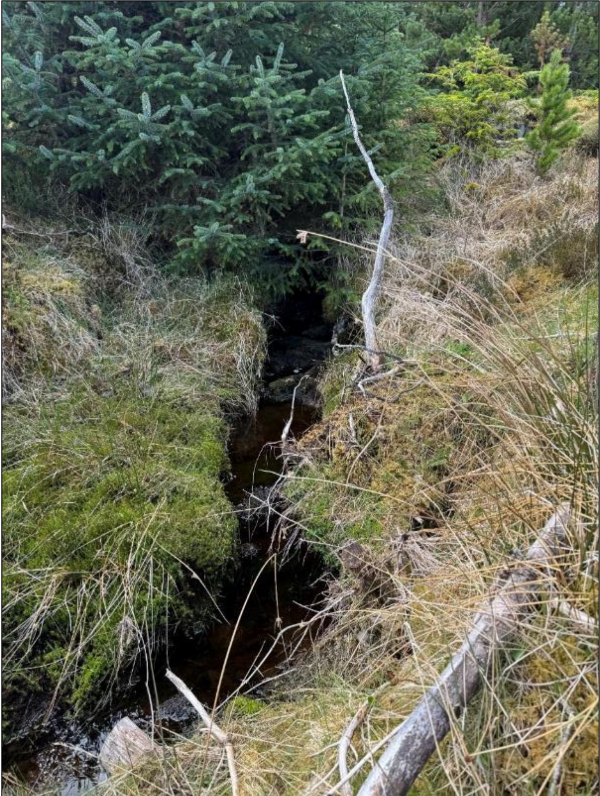
Figure A12. Photograph of stream crossing 12. Culvert outfall.