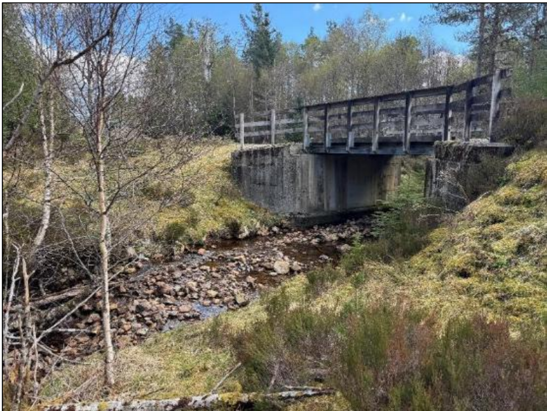
Figure A15. Photograph of stream crossing 15. Looking upstream.