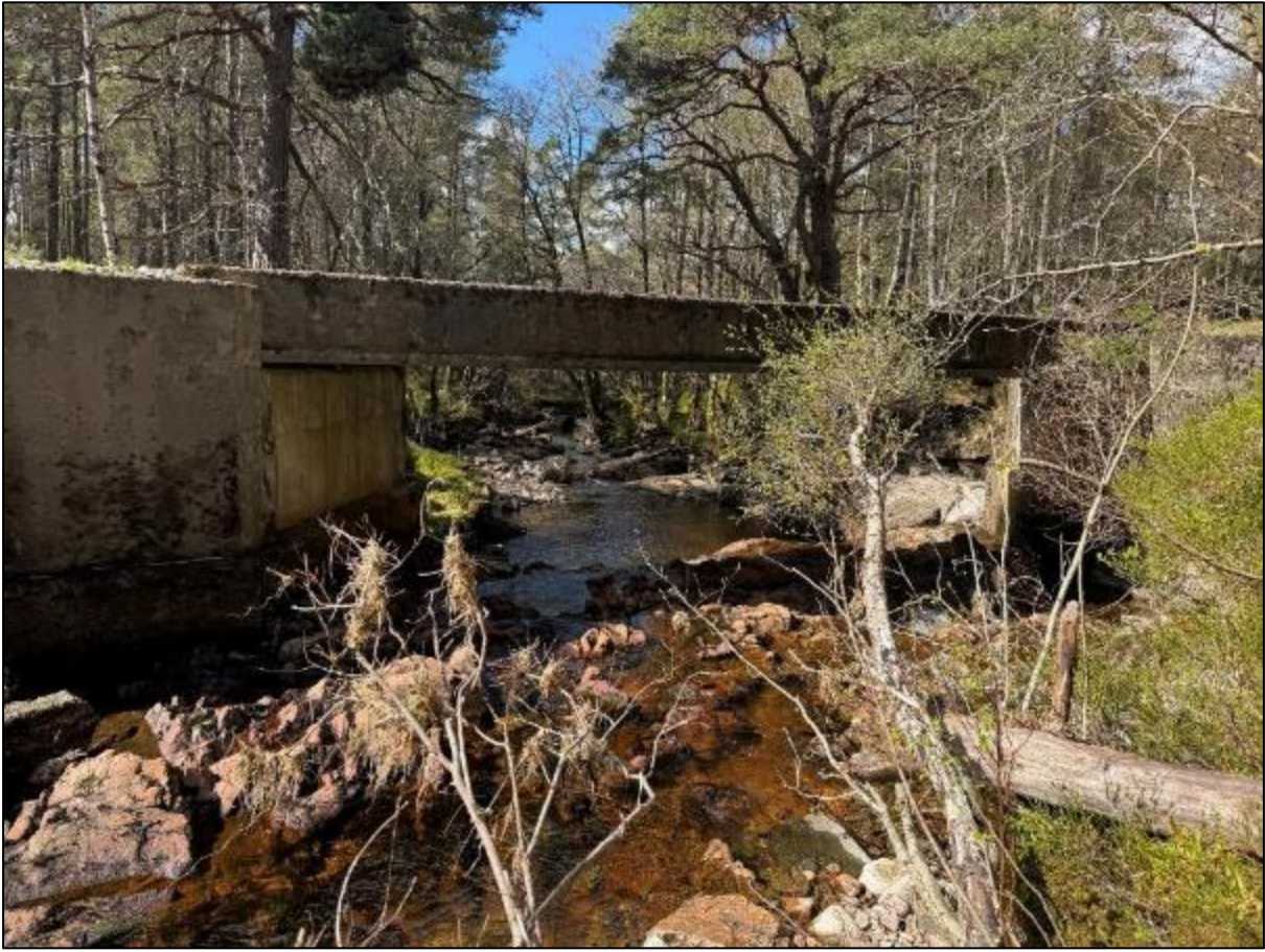
Figure A24. Photograph of stream crossing 24. Looking upstream.