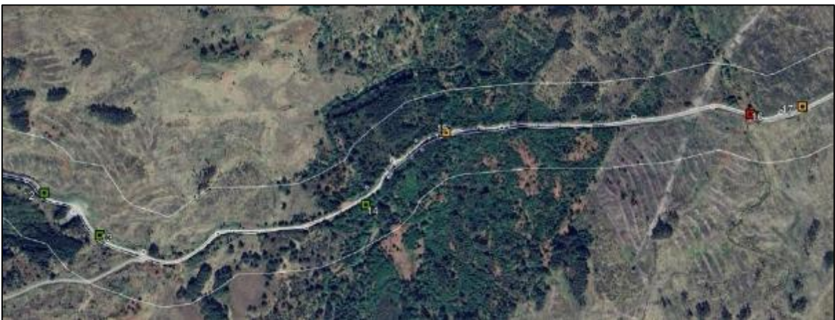
Figure 5. Location of stream crossings 12 to 17 (refer to Table 1 and point 8).