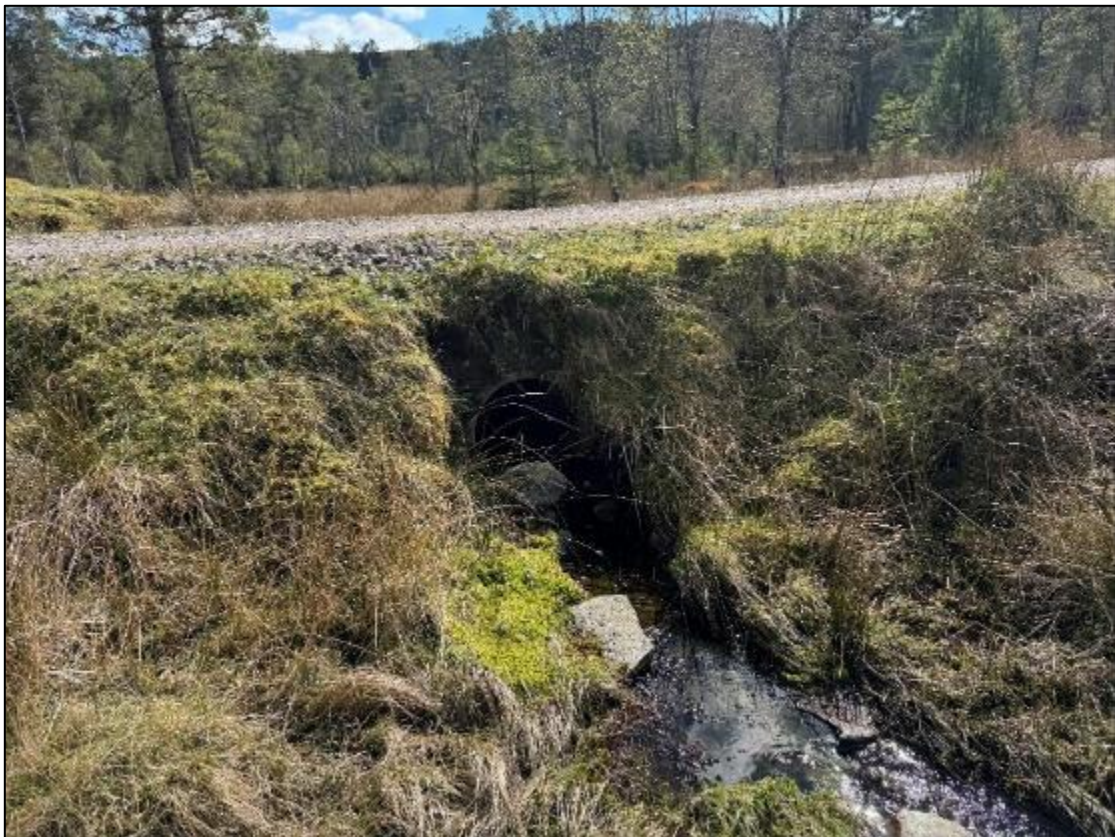
Figure A23. Photograph of stream crossing 23. Culvert outfall.