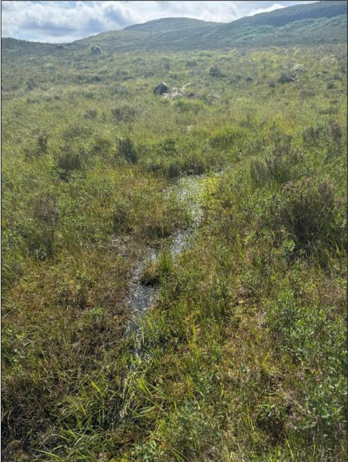
Figure A49. Photograph of proposed stream crossing 49 (no culvert at present). Looking upstream.