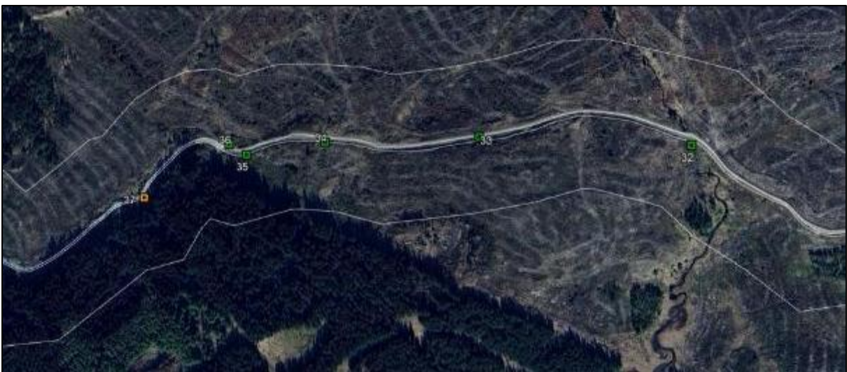
Figure 10. Location of stream crossings 32 to 37 (refer to Table 2 and point 8).