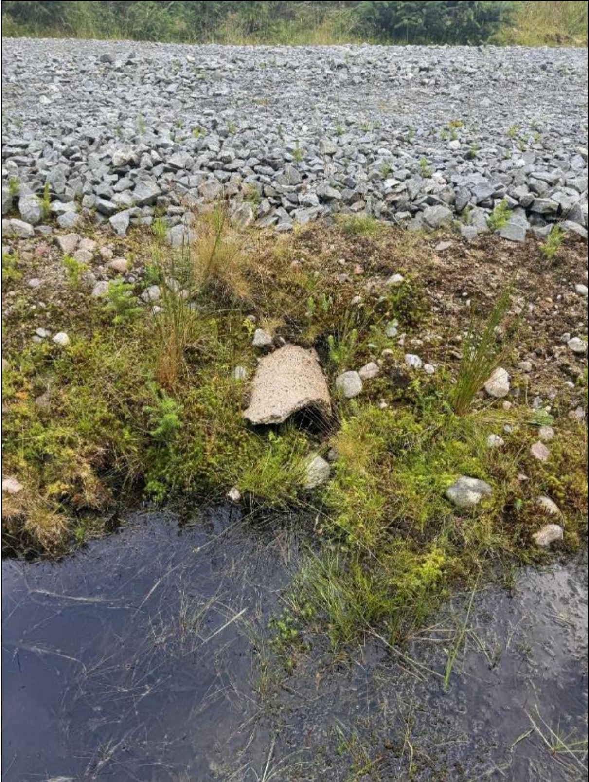
Figure A39. Photograph of stream crossing 39. Culvert entrance.