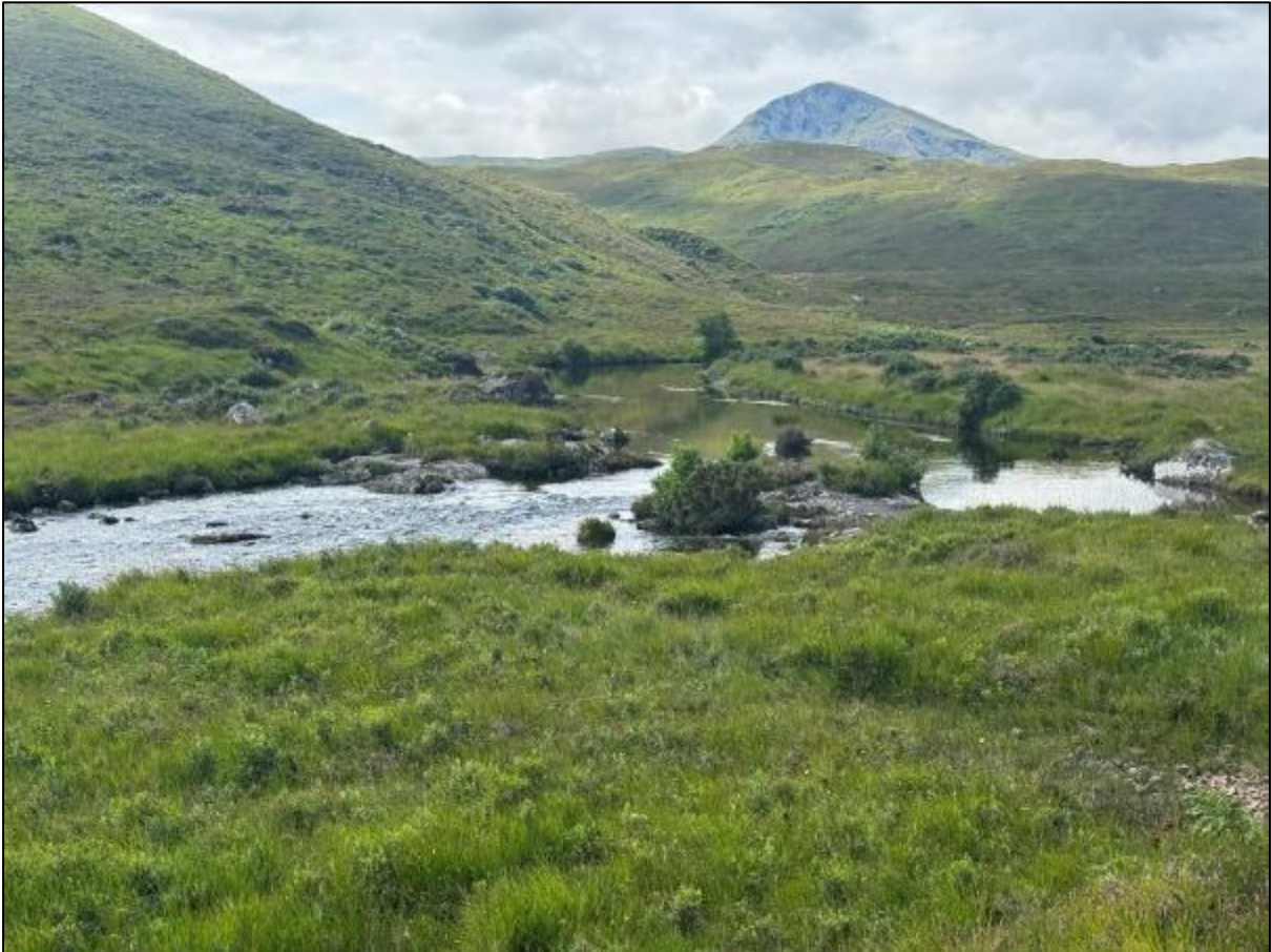
Figure A51. Photograph of proposed stream crossing 51 (Gearr Garry, no culvert at present). Looking upstream.