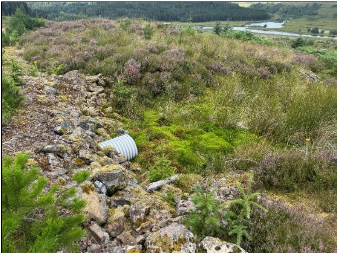
Figure A33. Photograph of stream crossing 33. Culvert outfall.