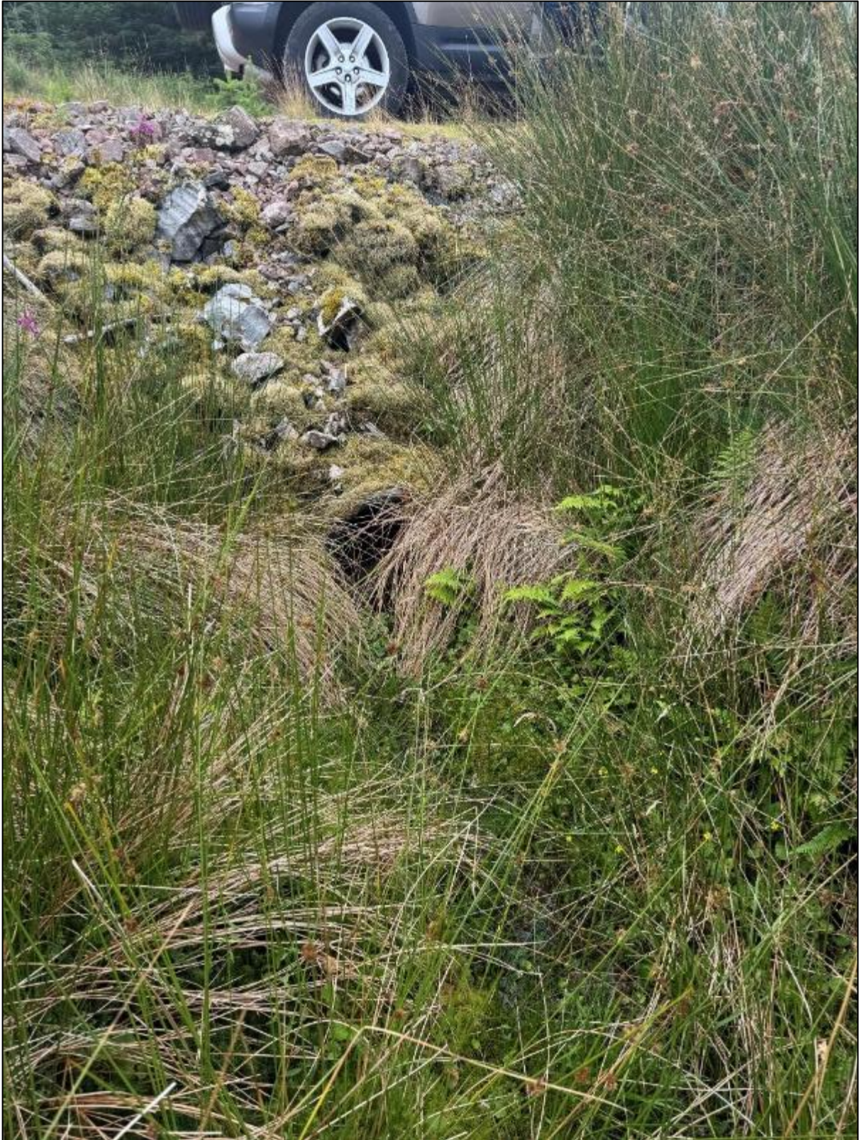
Figure A36. Photograph of stream crossing 36. Culvert outfall.