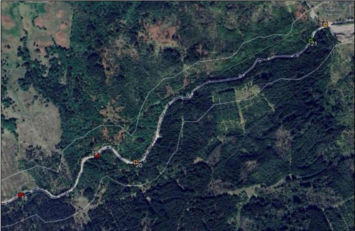
Figure 6. Location of stream crossings 18 to 22 (refer to Table 1 and point 8).