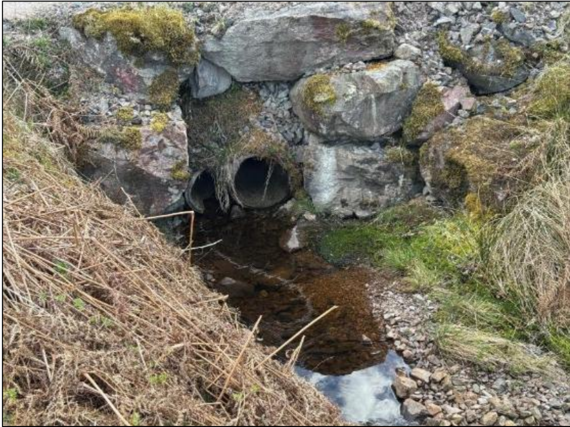
Figure A22. Photograph of stream crossing 22. Culvert outfall.