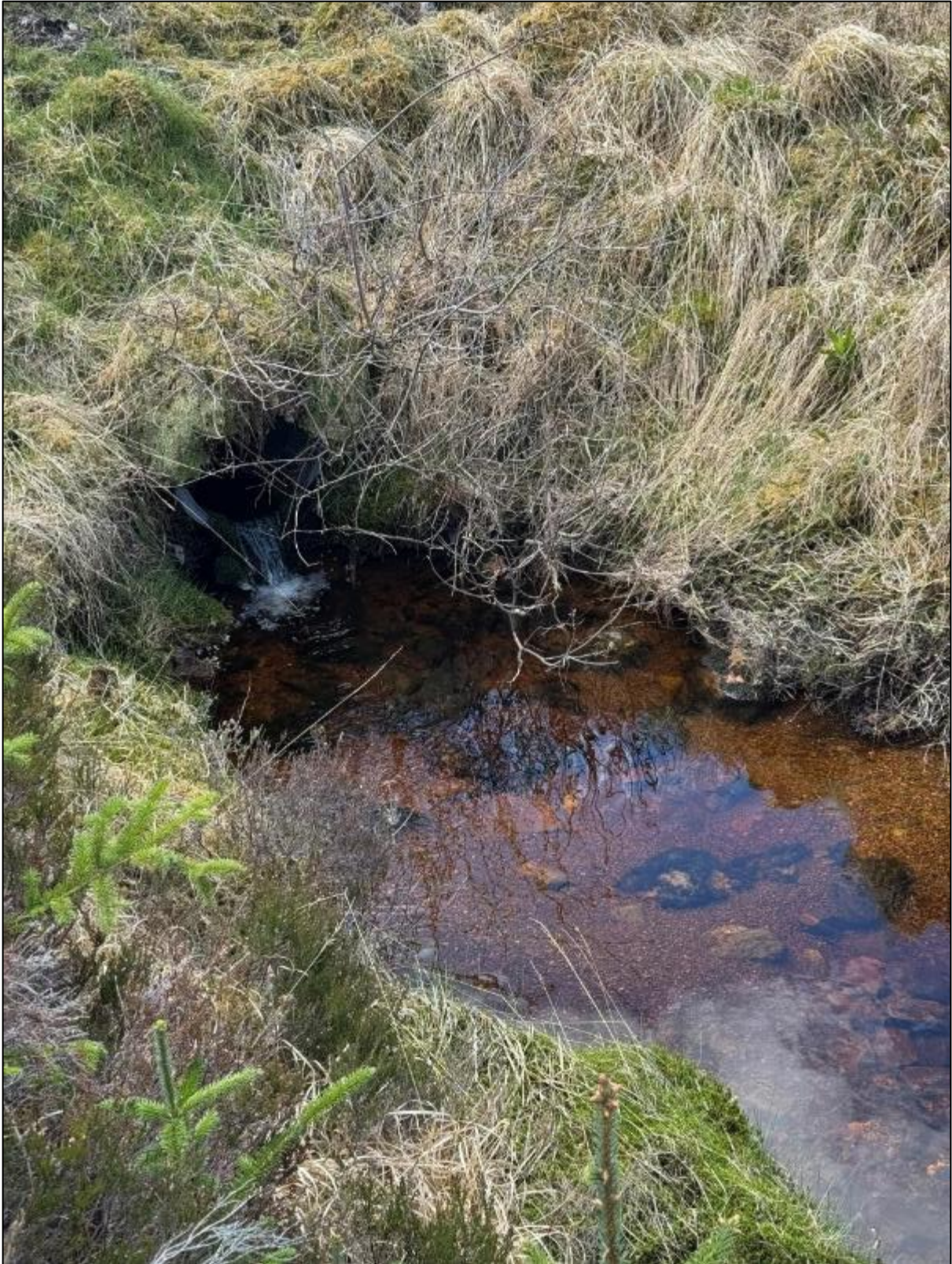
Figure A13. Photograph of stream crossing 13. Culvert outfall.