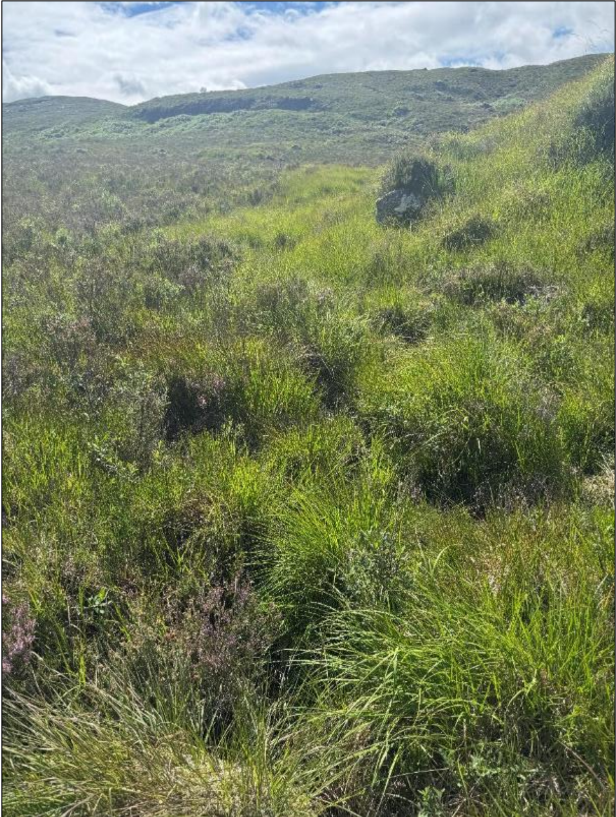
Figure A50. Photograph of proposed stream crossing 50 (no culvert at present). Looking upstream.