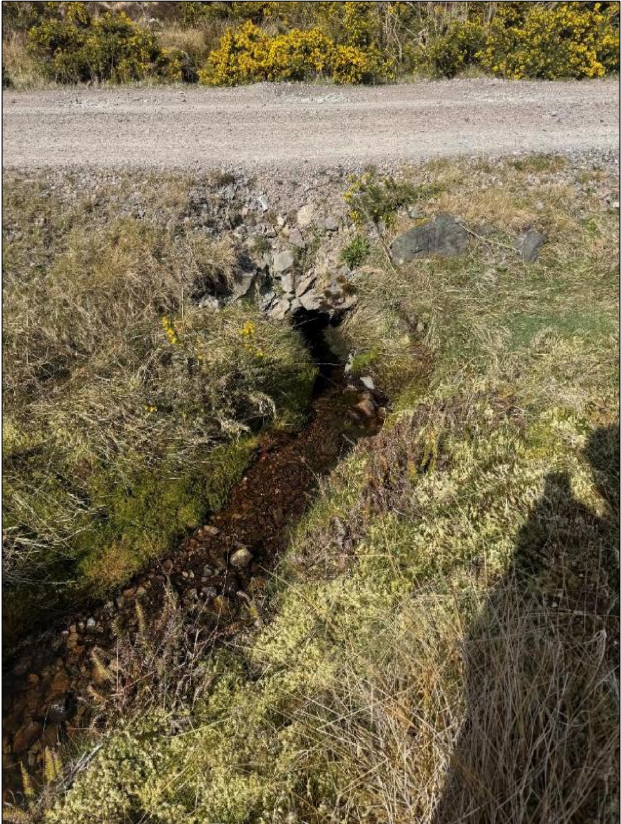
Figure A26. Photograph of stream crossing 26. Culvert entrance.