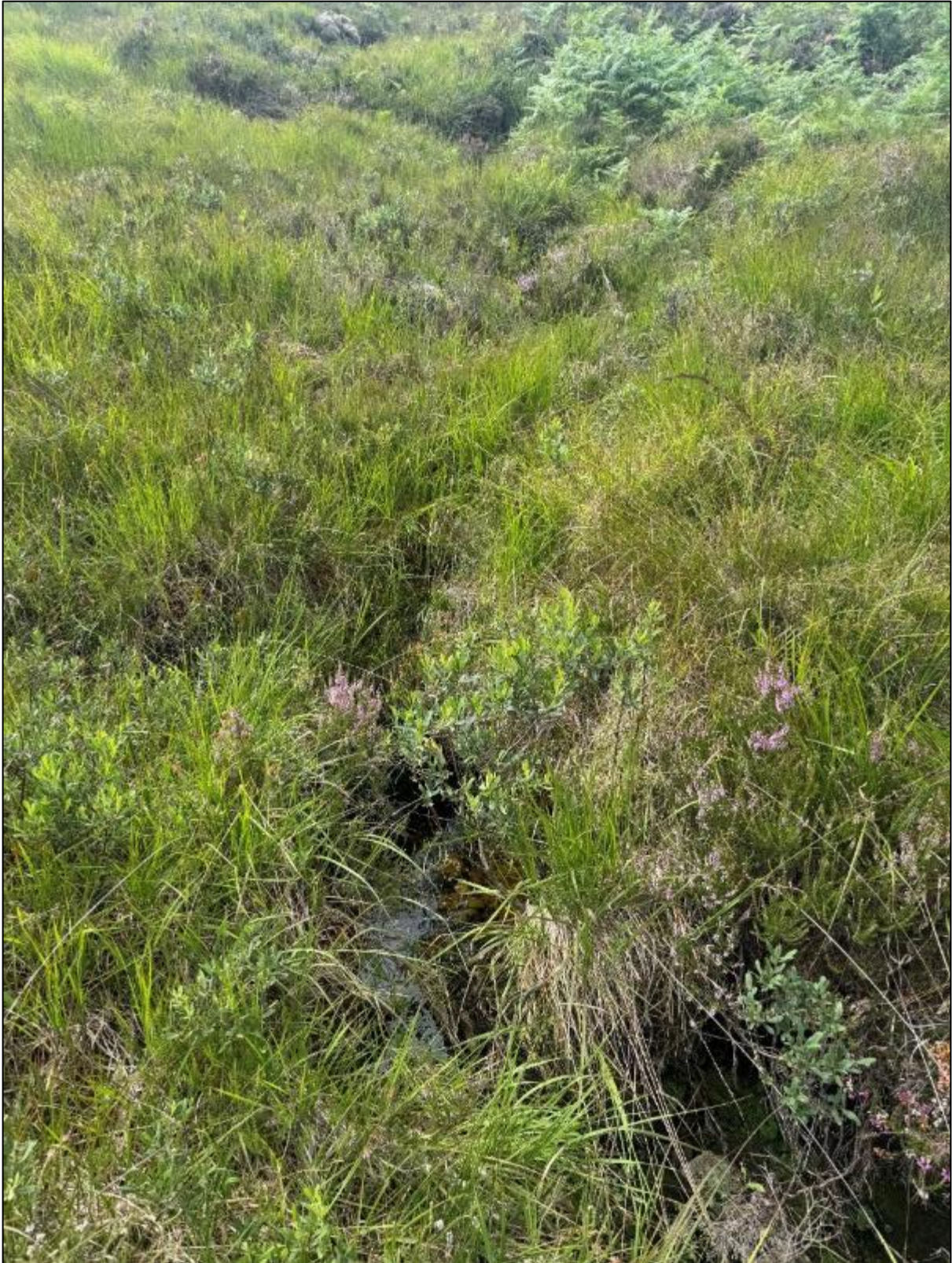
Figure A46. Photograph of proposed stream crossing 46 (no culvert at present). Looking upstream.