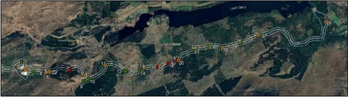
Figure 1. Location of the downstream 28 stream crossings identified on the 24 th April 2025 survey (see Table 1). Colour coding refers to the categories in point 8 and included in Table 1.