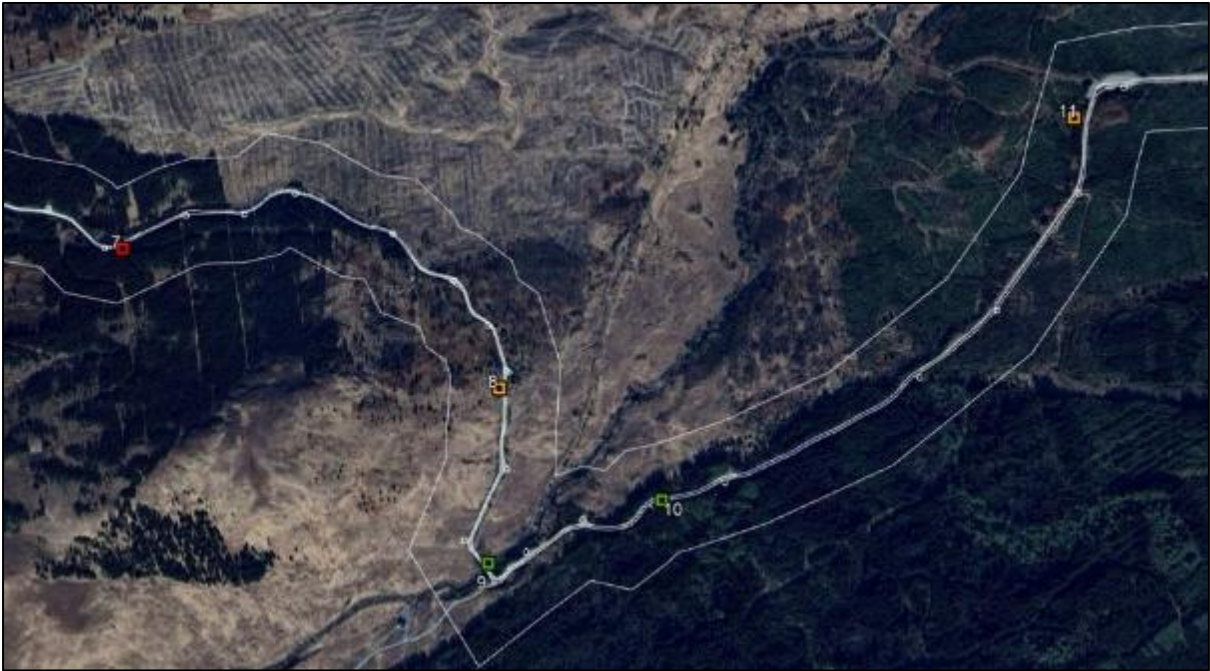
Figure 4. Location of stream crossings 7 to 11 (refer to Table 1 and point 8).