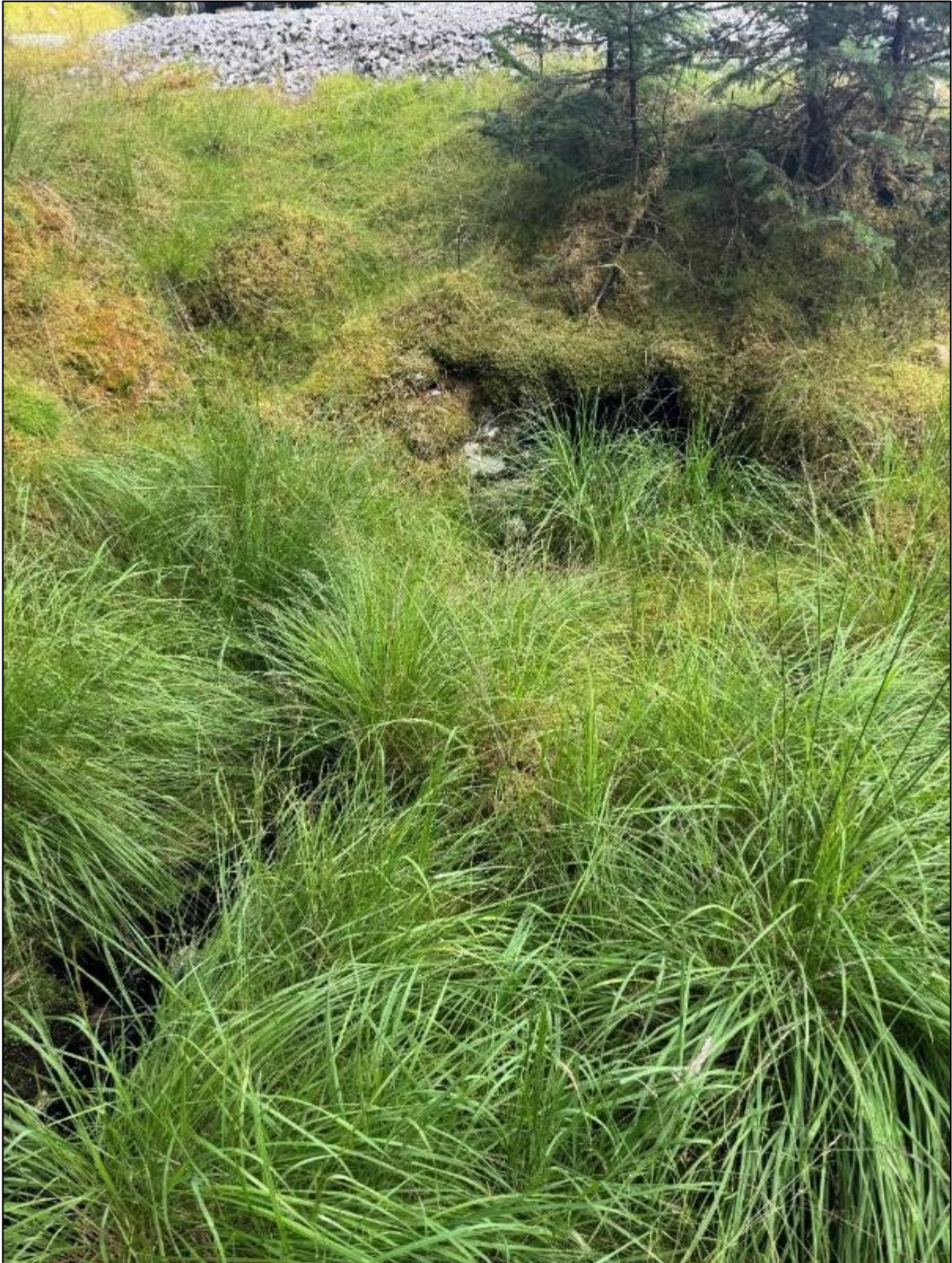
Figure A38. Photograph of stream crossing 38. Culvert entrance.