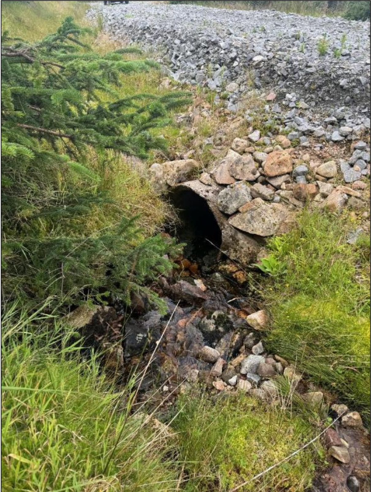
Figure A37. Photograph of stream crossing 37. Culvert entrance.