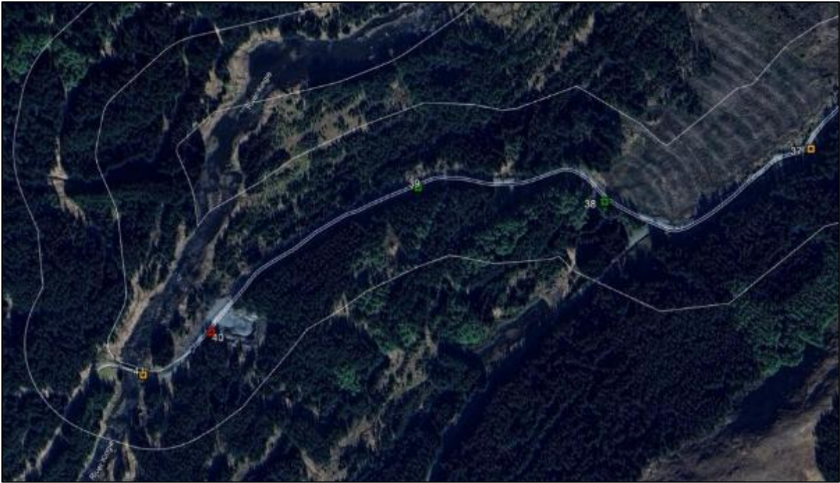
Figure 11. Location of stream crossings 38 to 41 (refer to Table 2 and point 8).