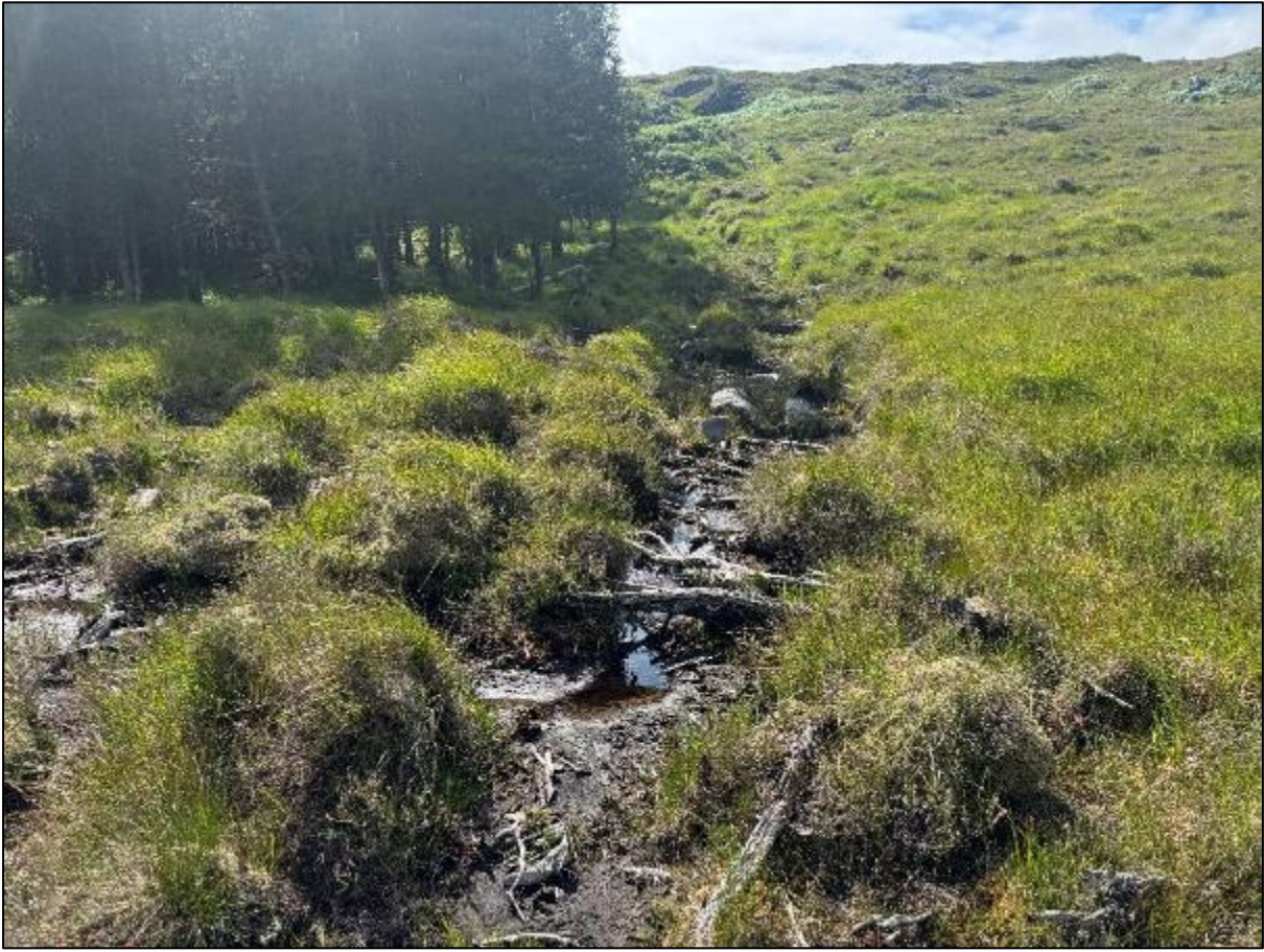
Figure 13. Erosion of peat associated with the stream proposed for SAR crossing 42.