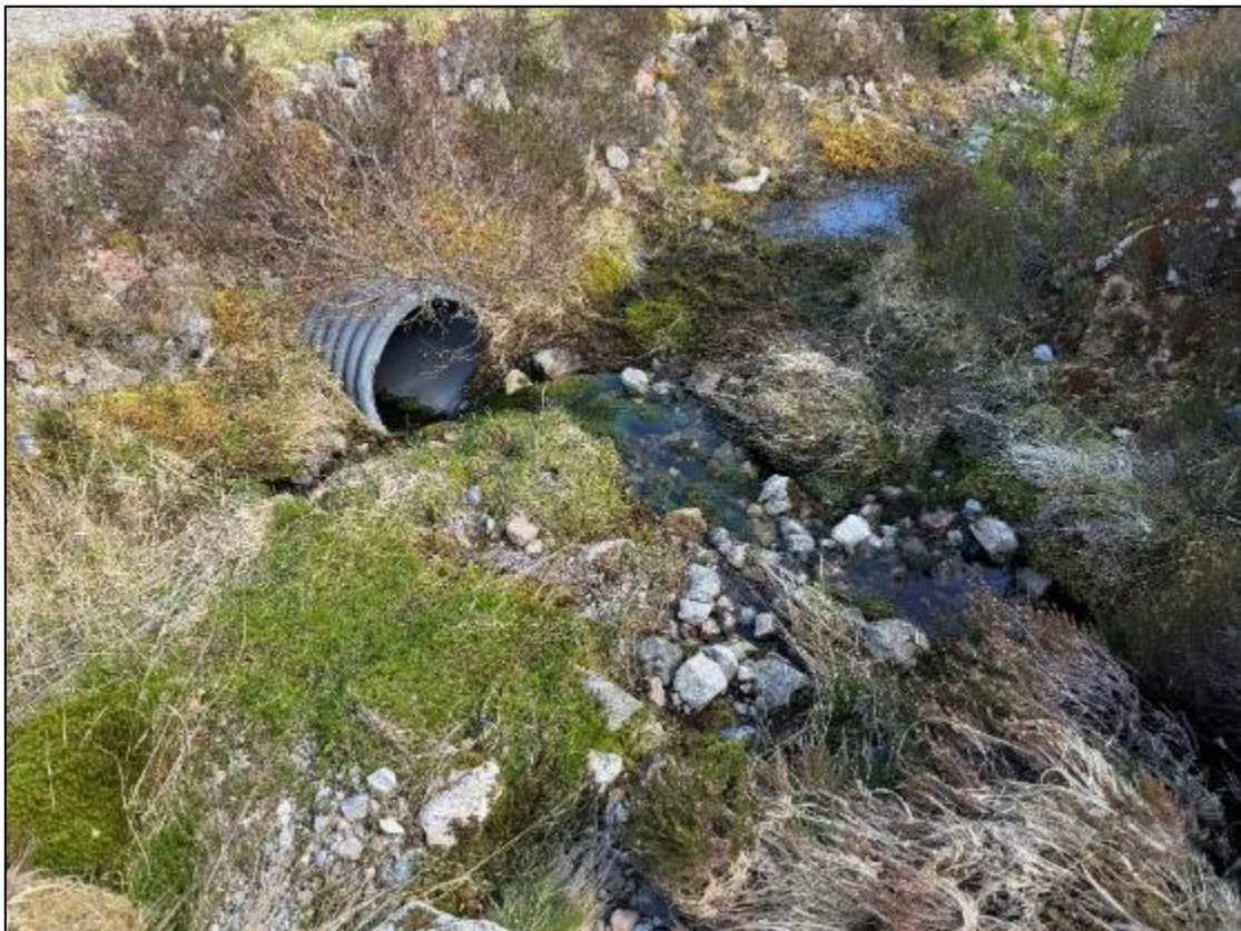
Figure A4. Photograph of stream crossing 4. Culvert entrance.