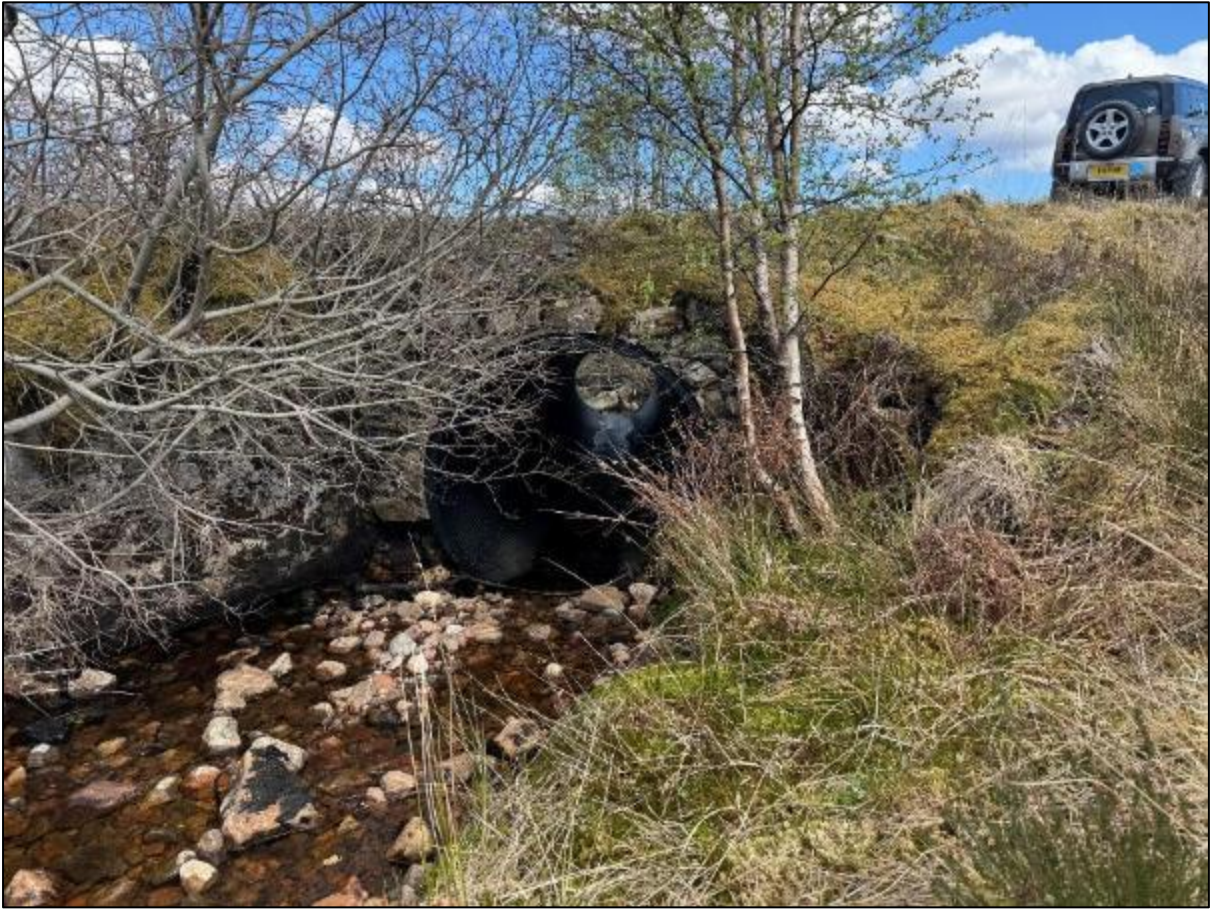
Figure A16. Photograph of stream crossing 16. Culvert entrance.