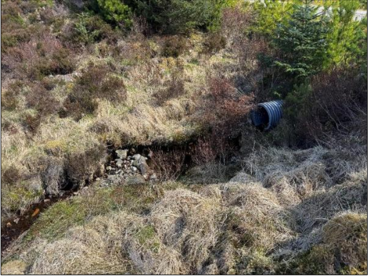
Figure A6. Photograph of stream crossing 6. Culvert outfall.