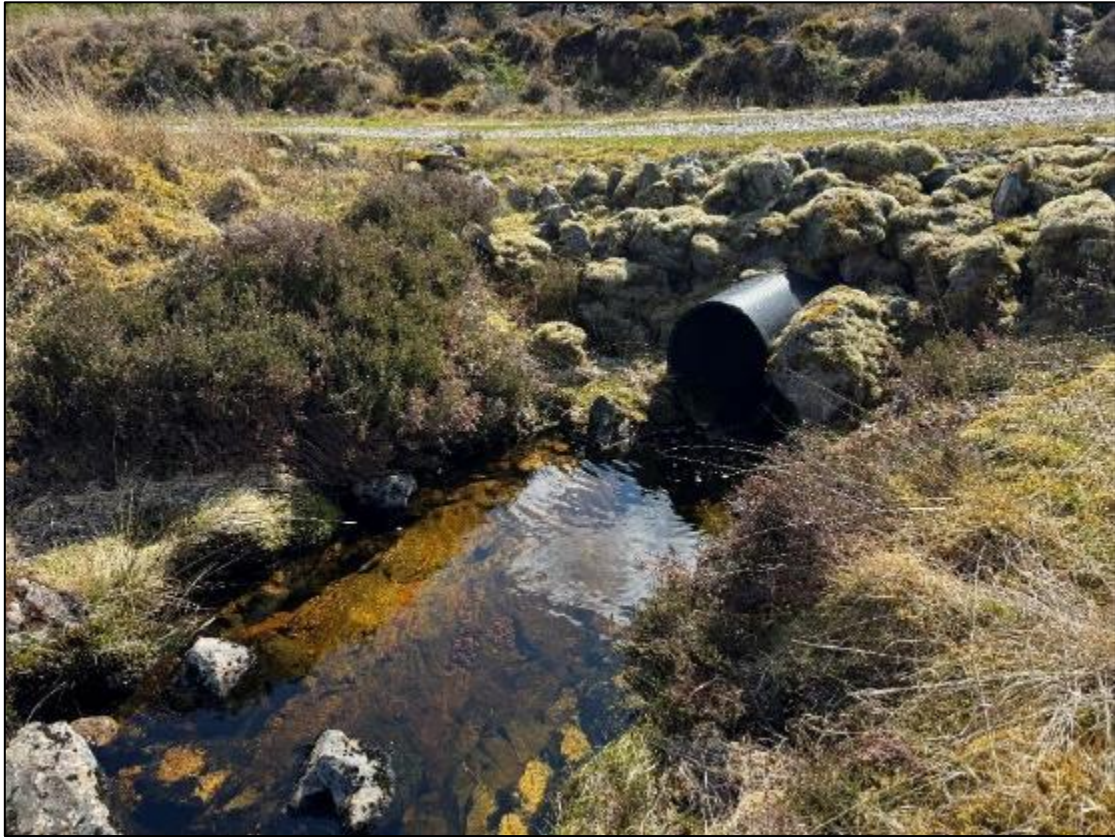
Figure A3. Photograph of stream crossing 3. Culvert outfall.