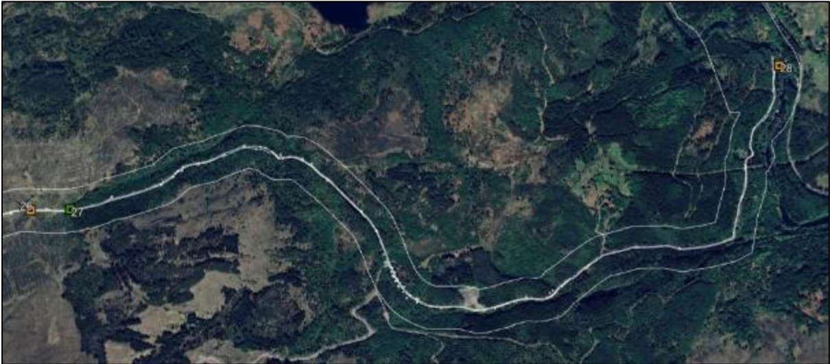
Figure 8. Location of stream crossings 26 to 28 (refer to Table 1 and point 8).