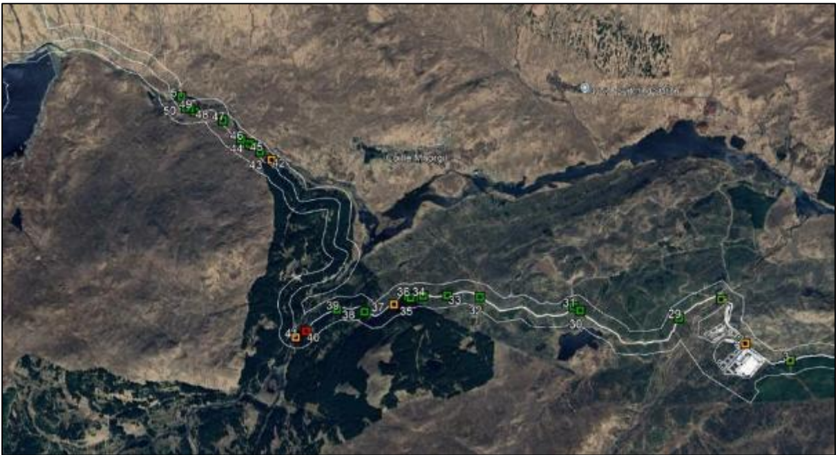
Figure 2. Location of the downstream 23 stream crossings identified on the 1 st August 2025 survey (see Table 2). Colour coding refers to the categories in point 8 and included in Table 2.