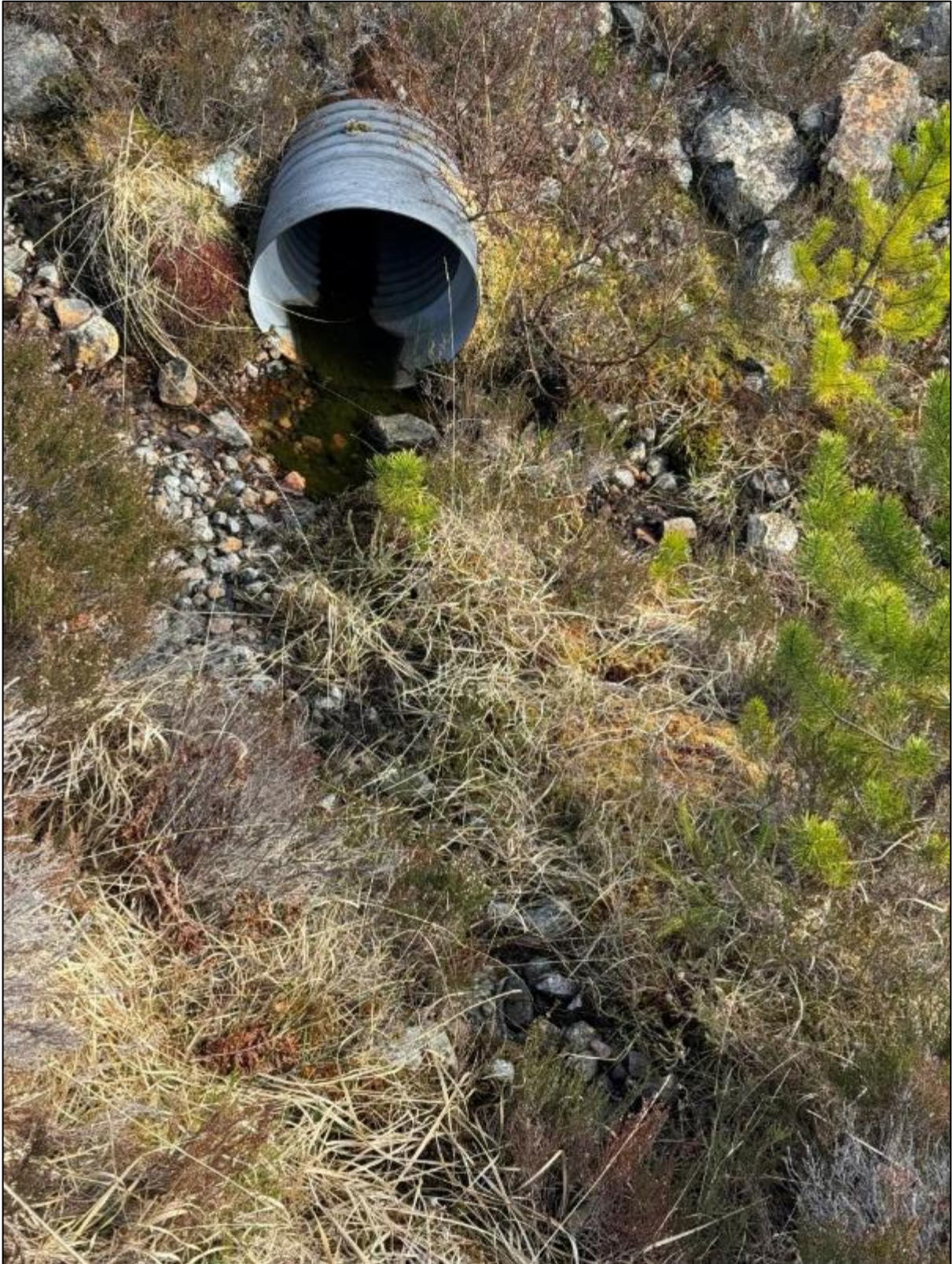
Figure A8. Photograph of stream crossing 8. Culvert entrance.