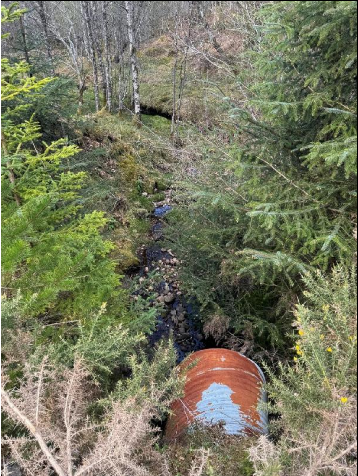
Figure A20. Photograph of stream crossing 20. Culvert outfall.