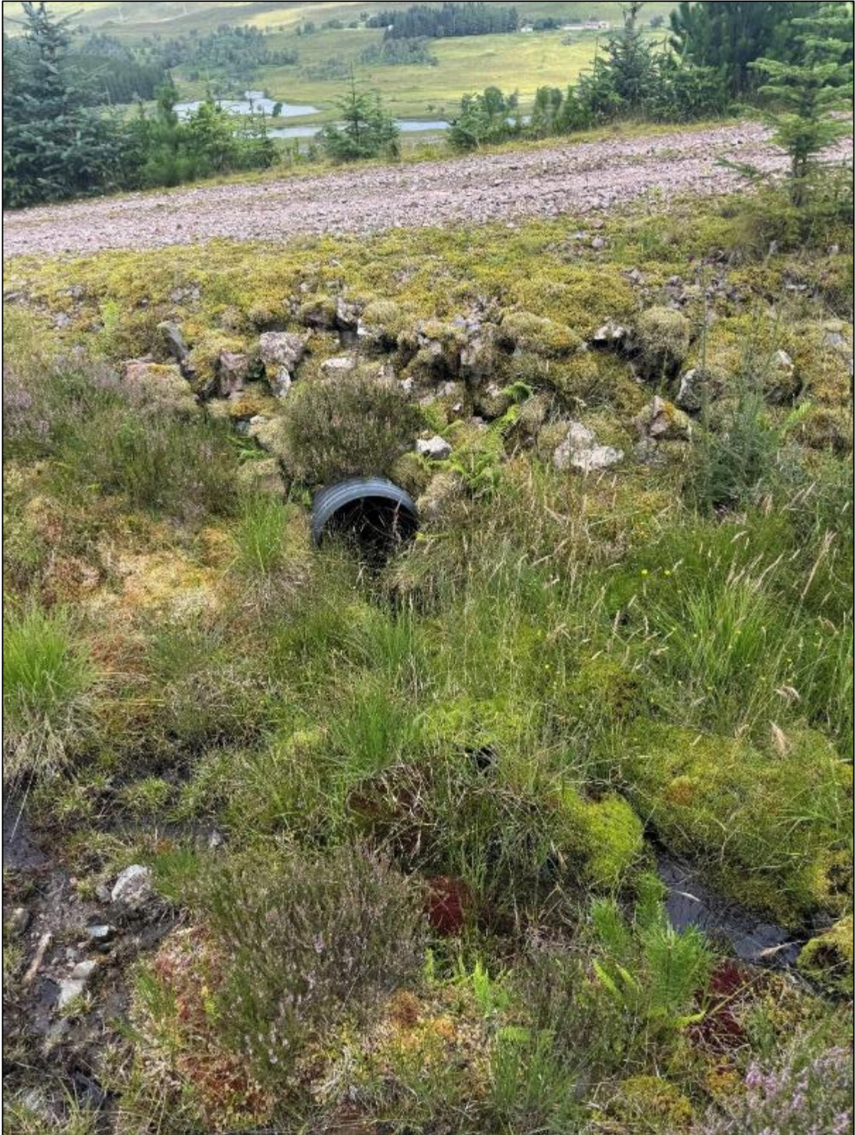
Figure A35. Photograph of stream crossing 35. Culvert entrance.