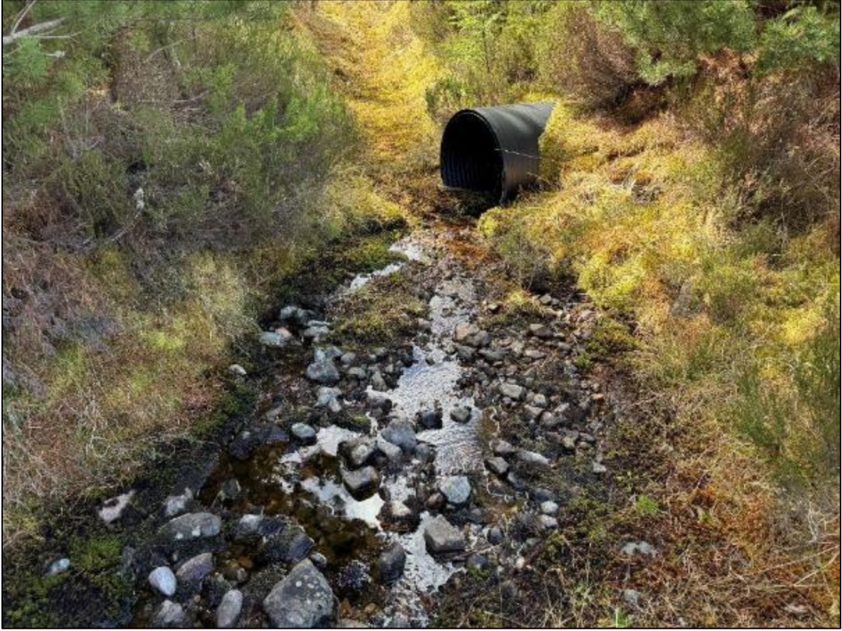
Figure A11. Photograph of stream crossing 11. Culvert entrance.