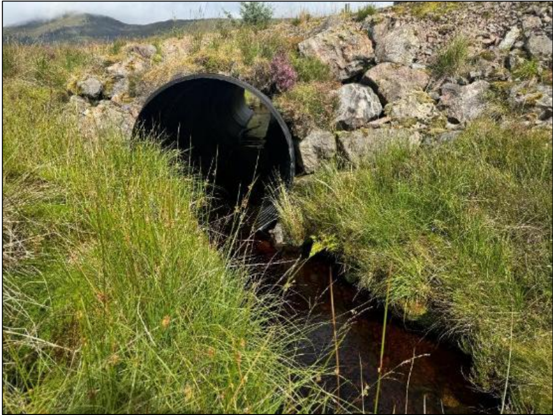
Figure A32. Photograph of stream crossing 32. Culvert entrance.