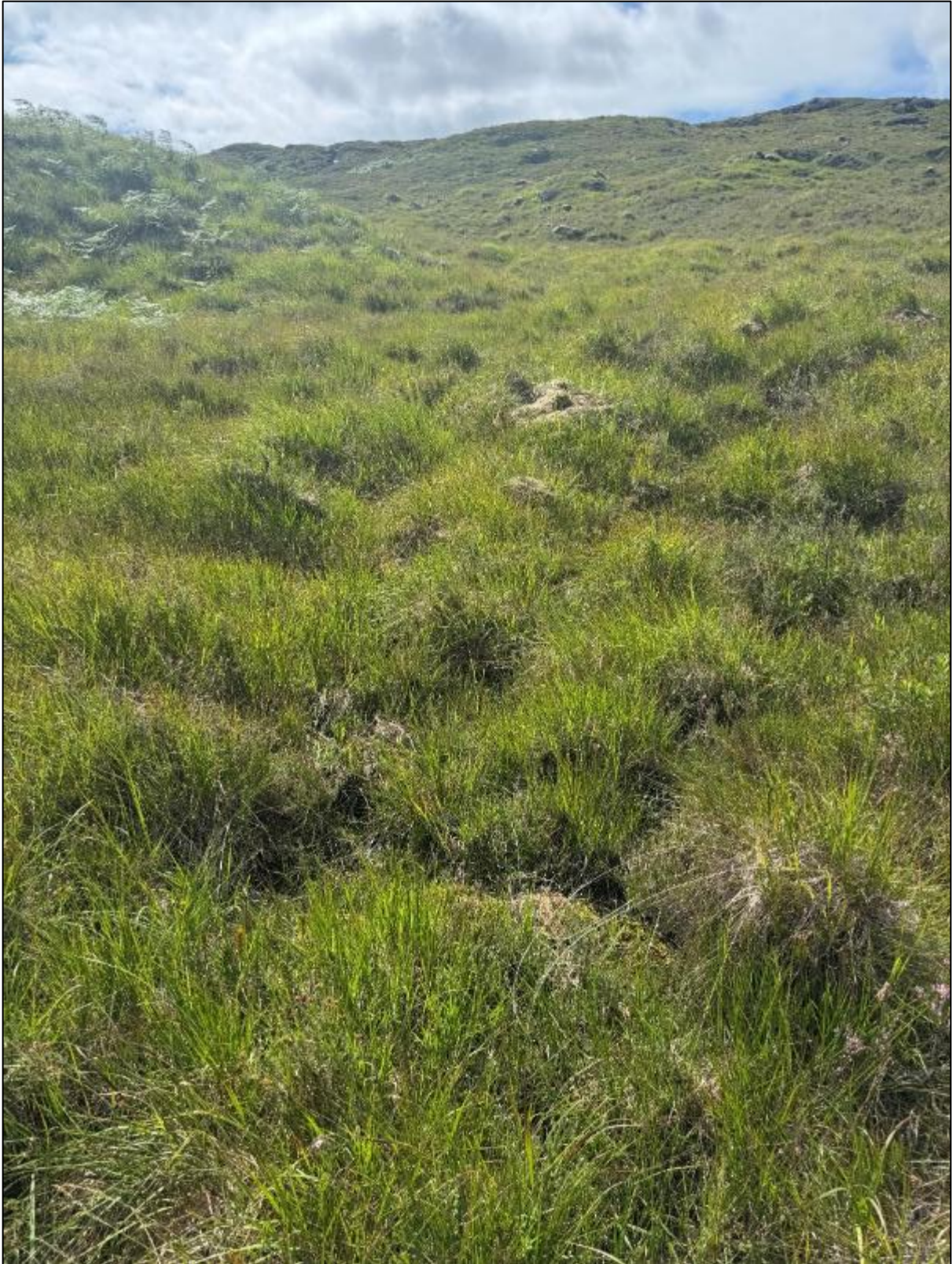
Figure A44. Photograph of proposed stream crossing 44 (no culvert at present). Looking upstream.