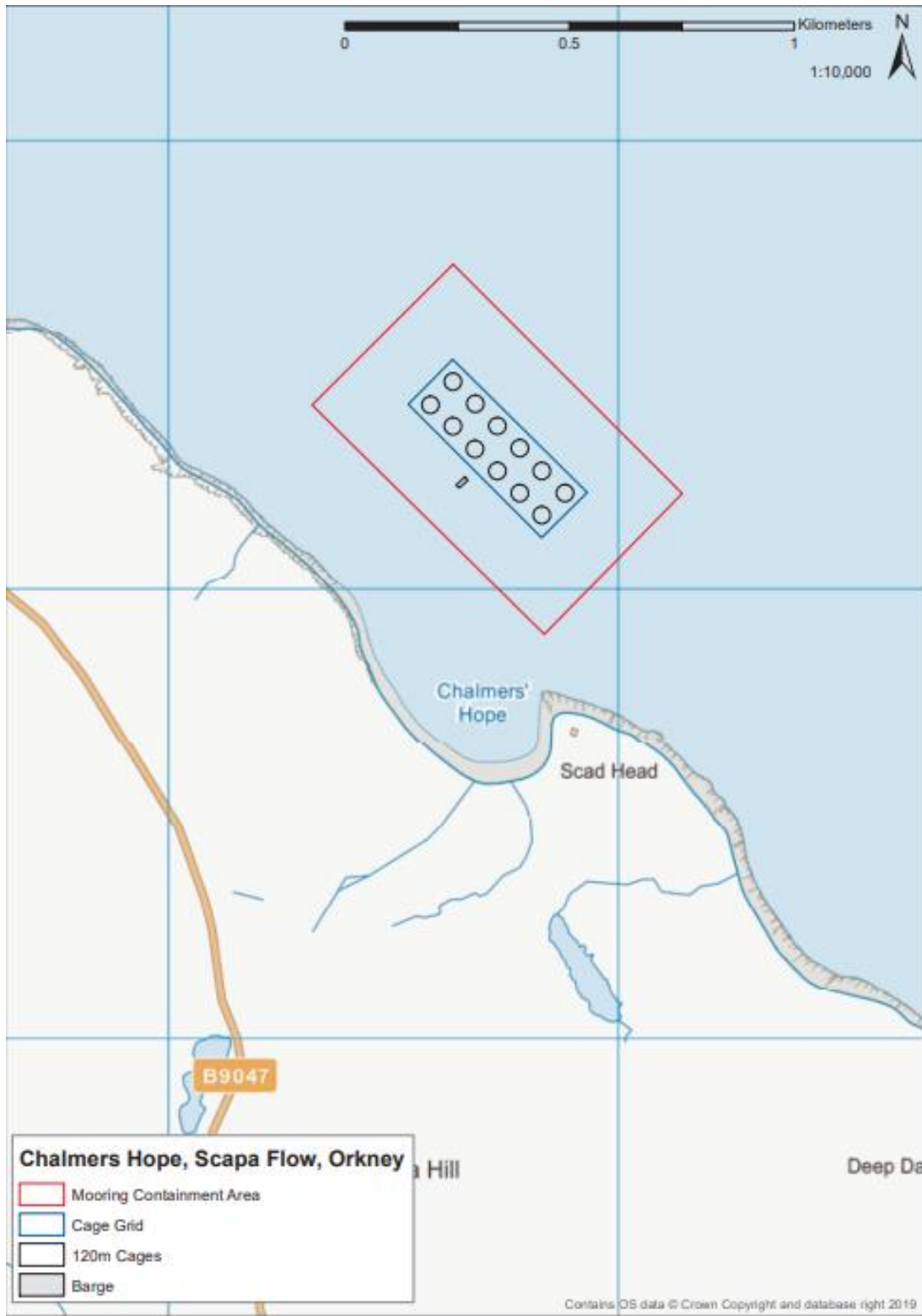
Figure 1 Fish Pen Location