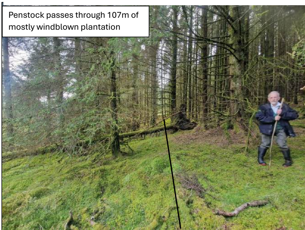
Figure 6 - View down penstock – windblown plantation