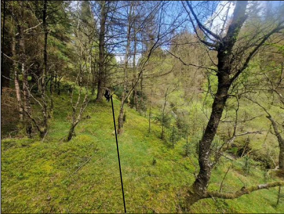
Figure 5 - View up penstock – riparian area planted with larch, now diseased or dead