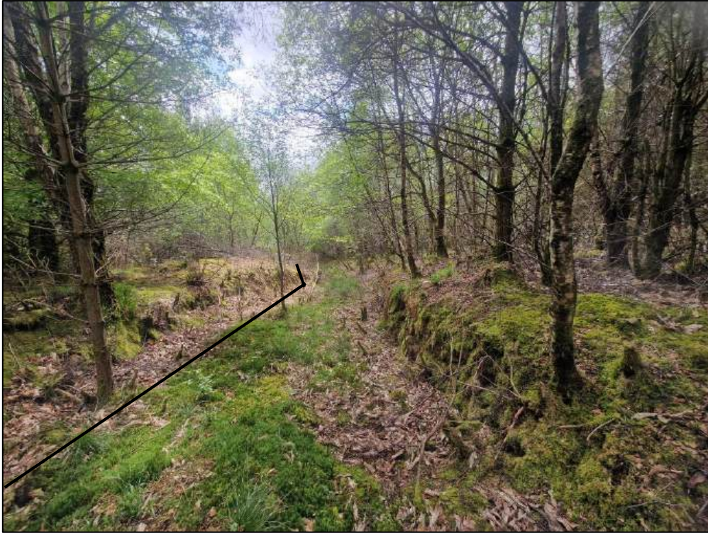
Figure 25 – view down penstock along overgrown track – penstock follows overgrown track for 305m.