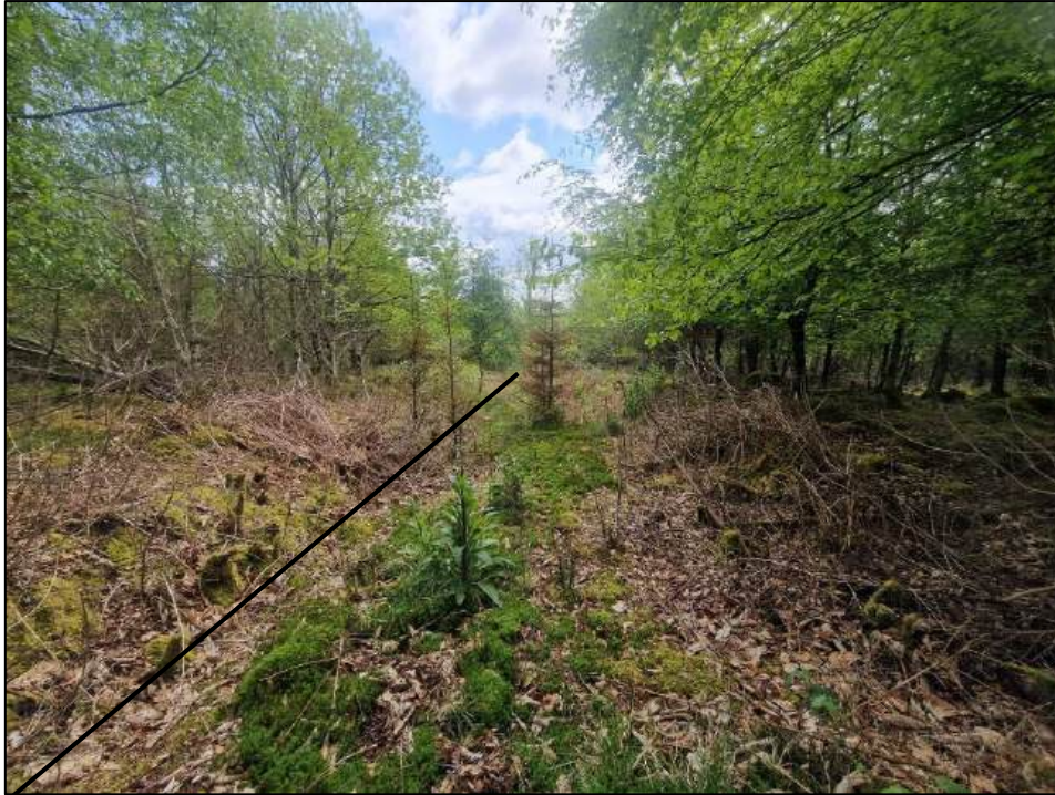
Figure 27 – view down penstock along overgrown track