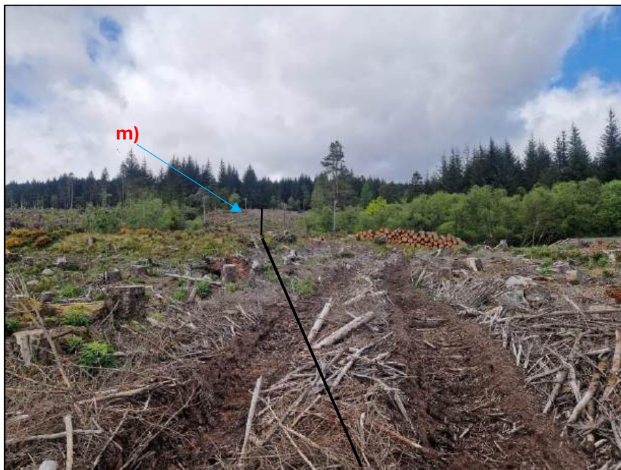
Figure 18 – view up penstock