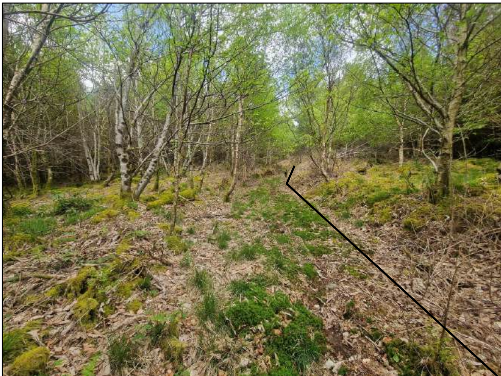
Figure 26 – view up penstock along overgrown track