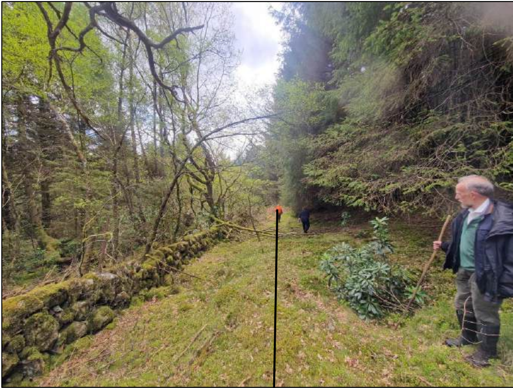
Figure 9 – view down penstock – penstock follows plantation ride