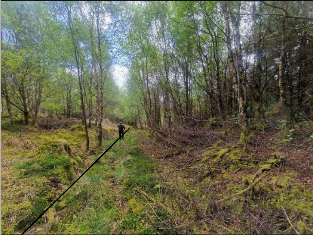
Figure 29 – view down penstock along overgrown track