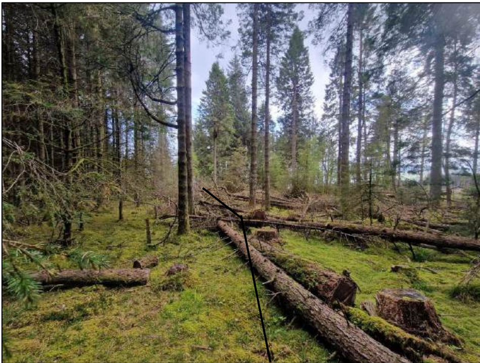
Figure 14 – view down penstock – penstock passes through windblow