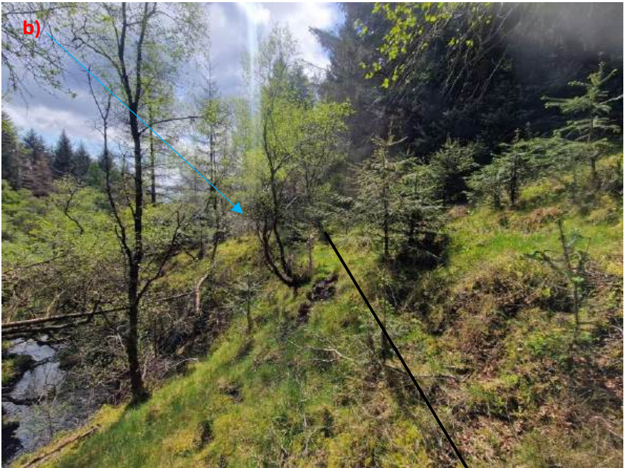
Figure 2 - View downhill from intake