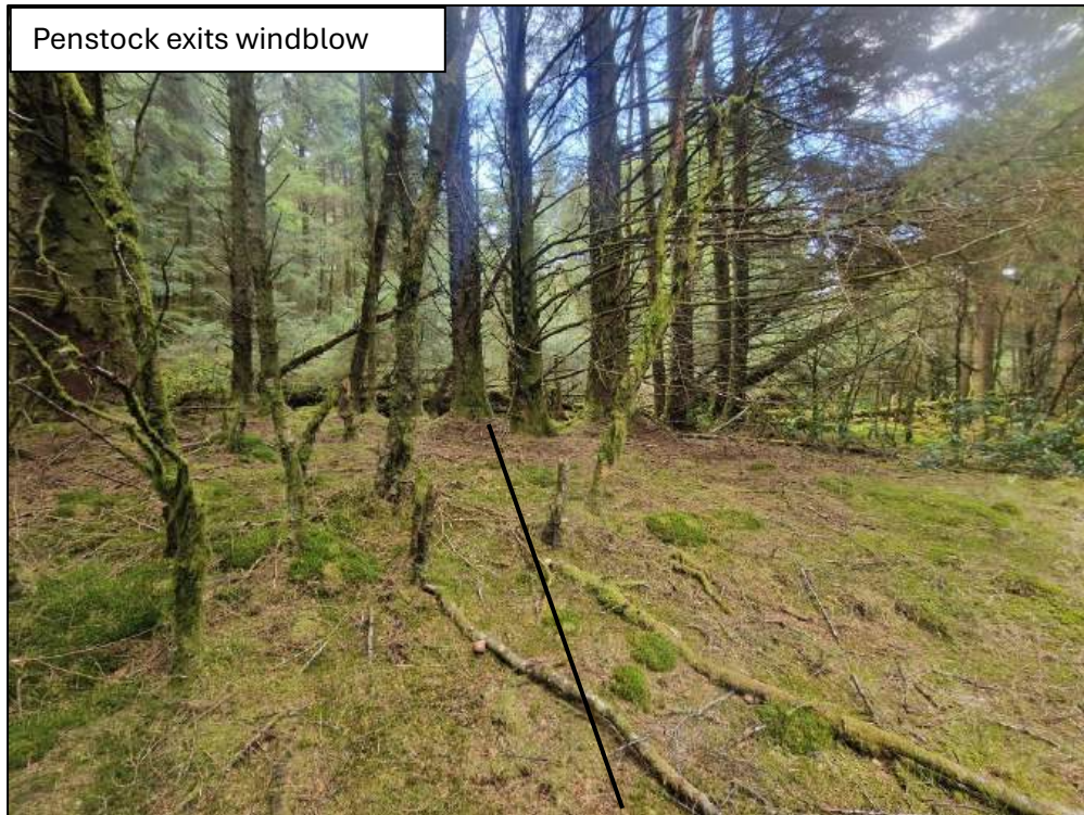
Figure 7 – view up penstock – windblown plantation