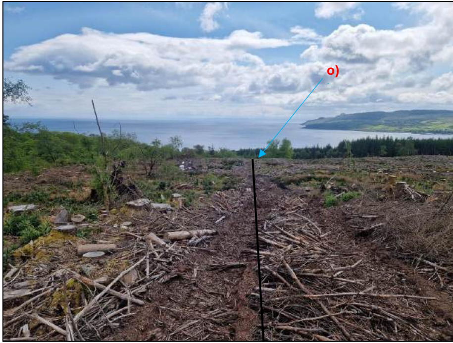
Figure 19 – view down penstock. Route was previously an ATV track/forestry ride.