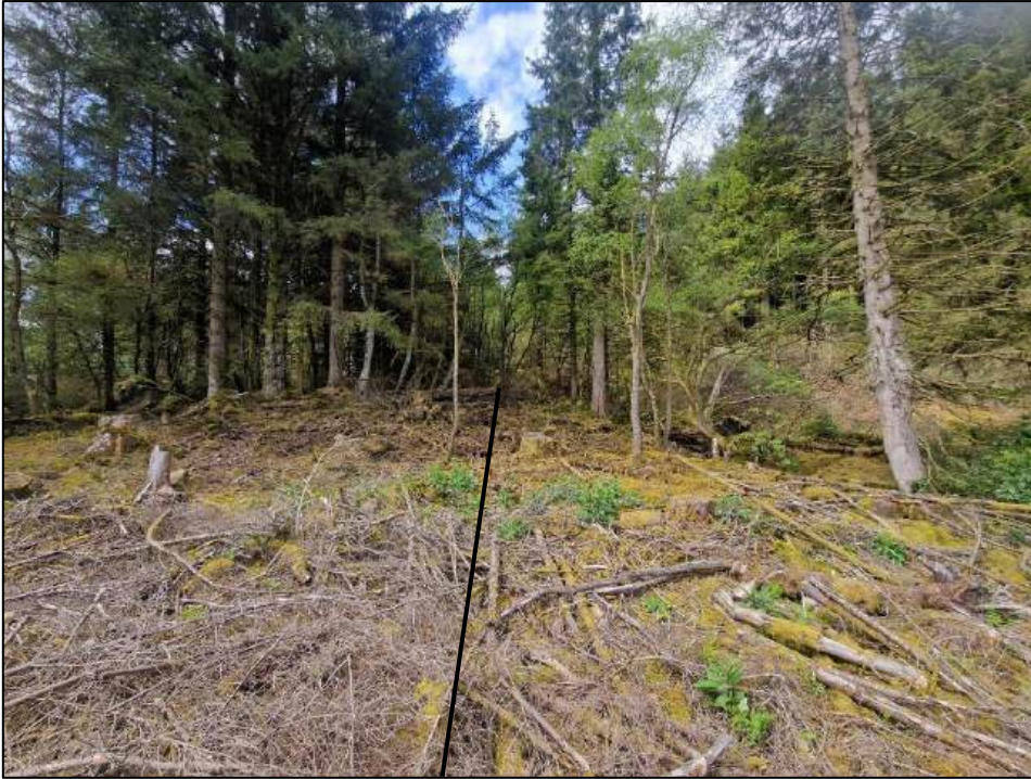
Figure 15 – view up penstock – penstock exits windblow