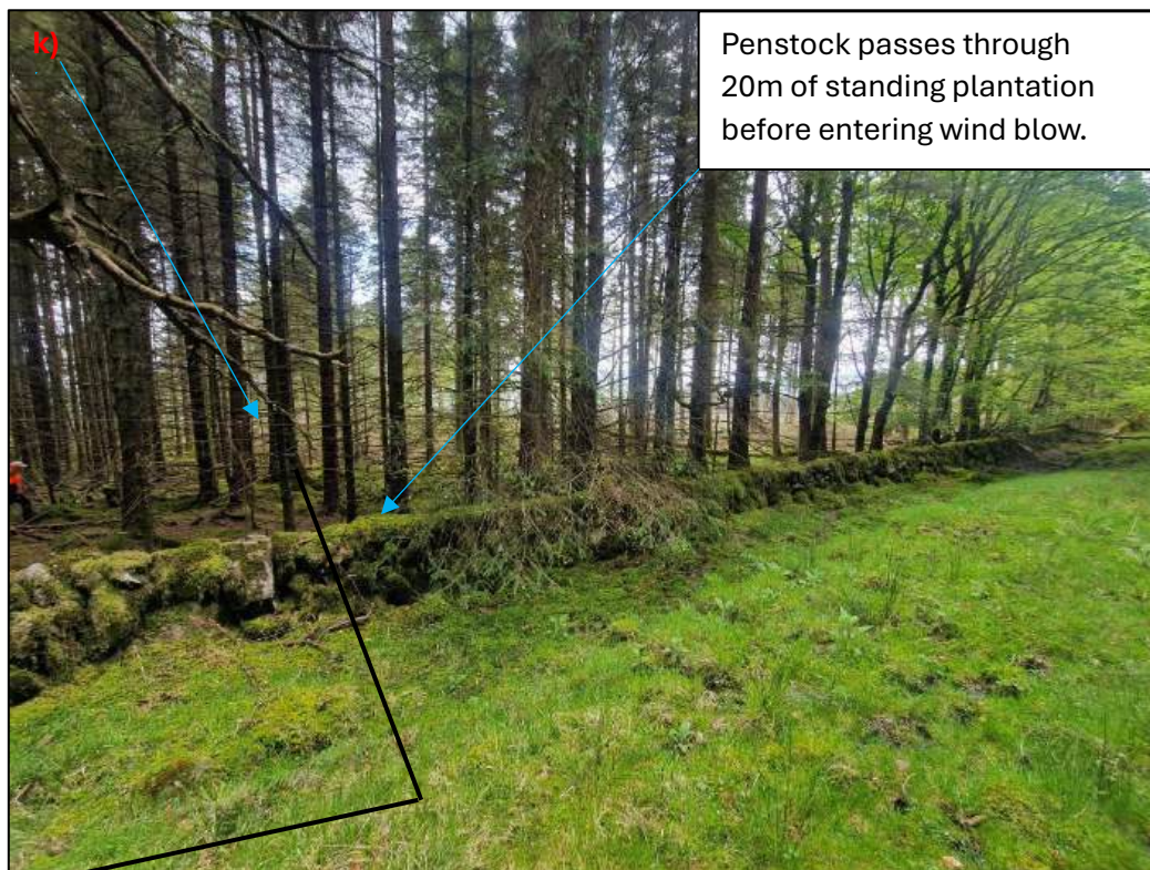
Figure 12 – view down penstock turns into plantation for 20m and then through windblow