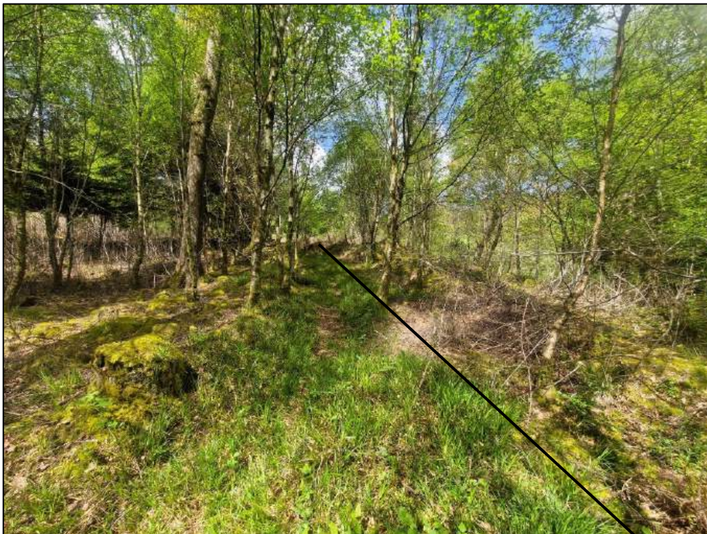
Figure 24 – Penstock within overgrown ATV track, looking up