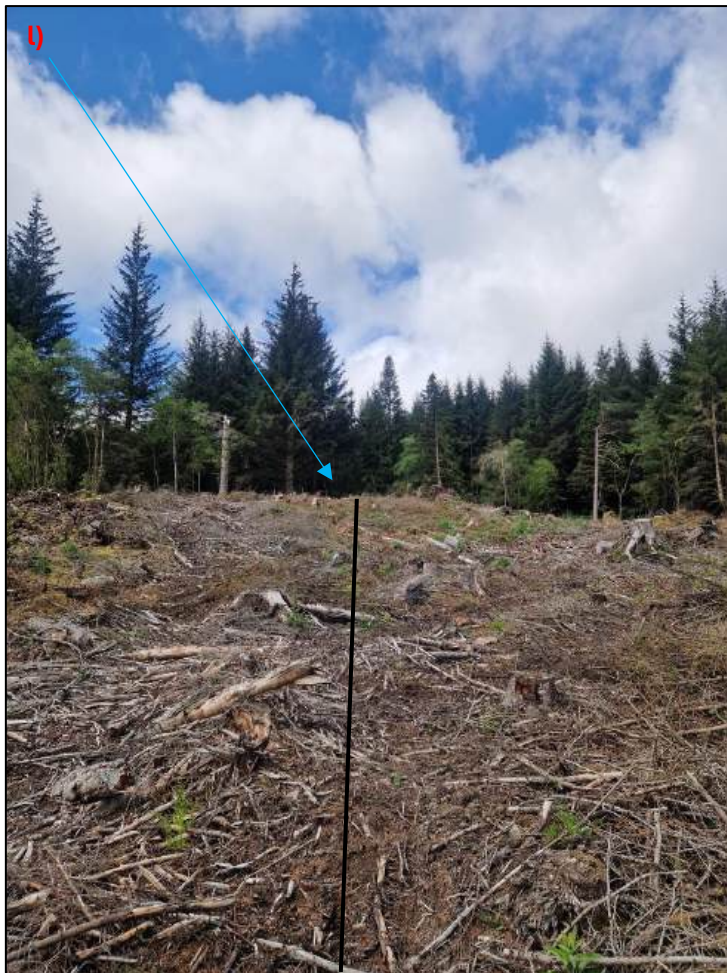
Figure 16 – view up penstock