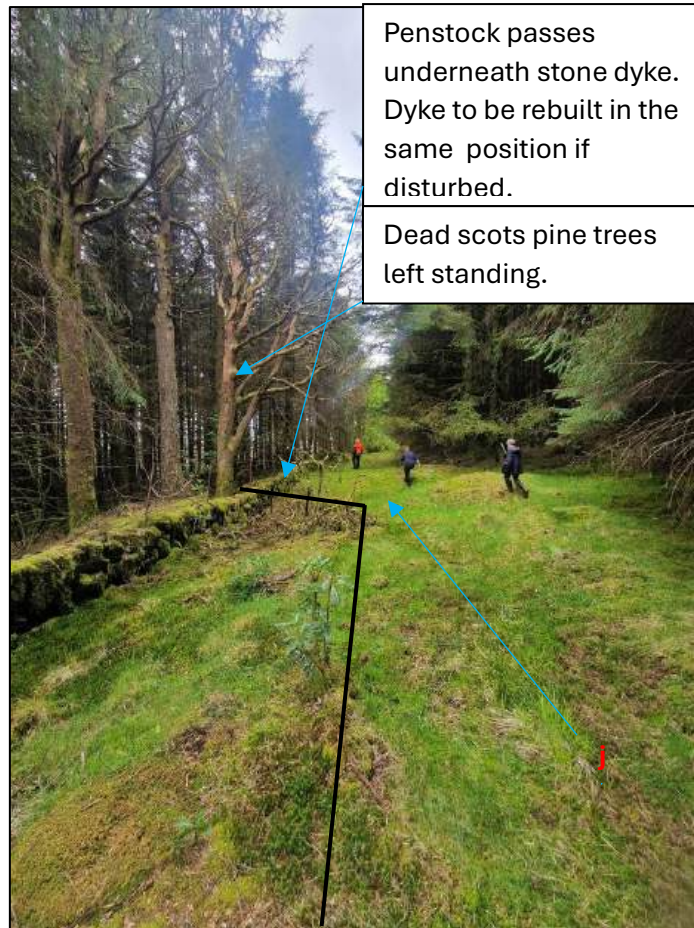
Figure 11 – view down penstock – penstock follows plantation ride