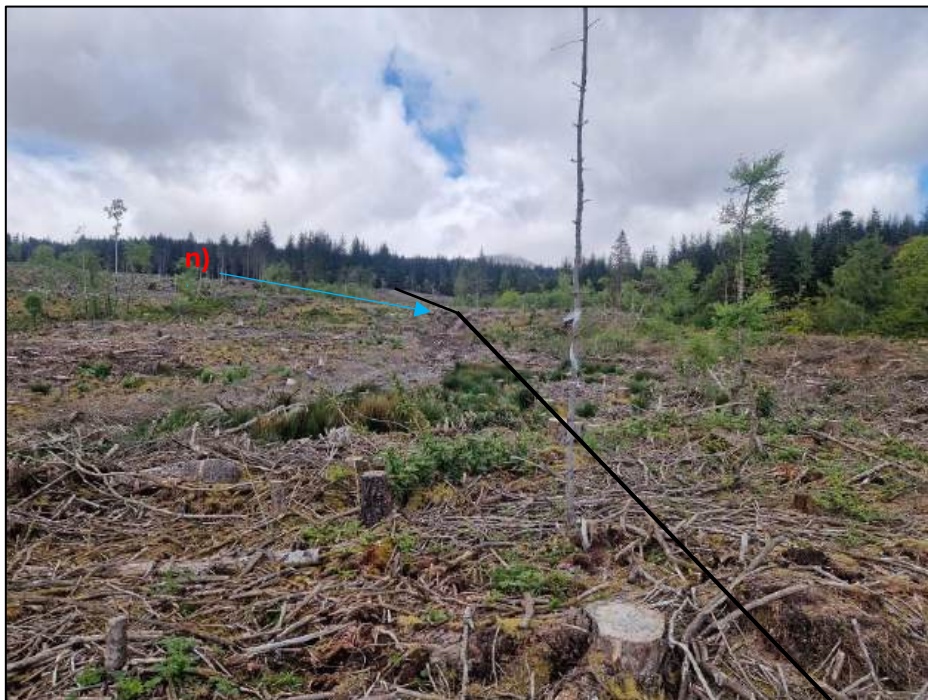
Figure 20 – view up penstock. Route was previously an ATV track/forestry ride.