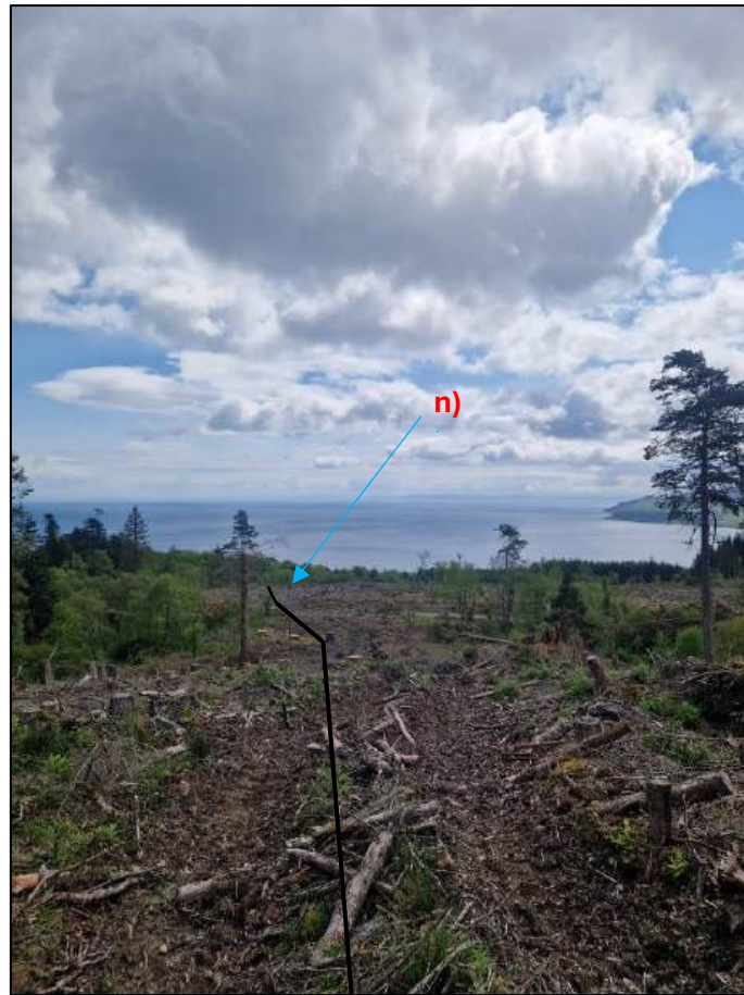
Figure 17 – view down penstock – penstock passes through clear felled plantation for 530m along route which was previously an ATV track/forestry ride.