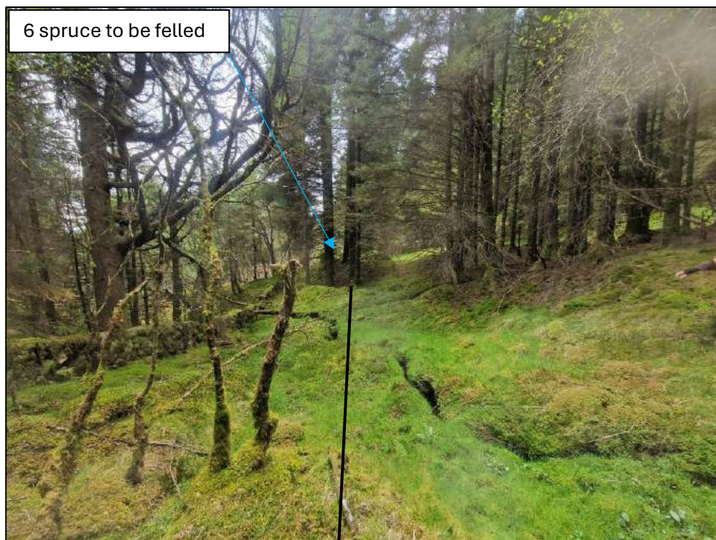
Figure 8 – view down penstock – penstock follows plantation ride