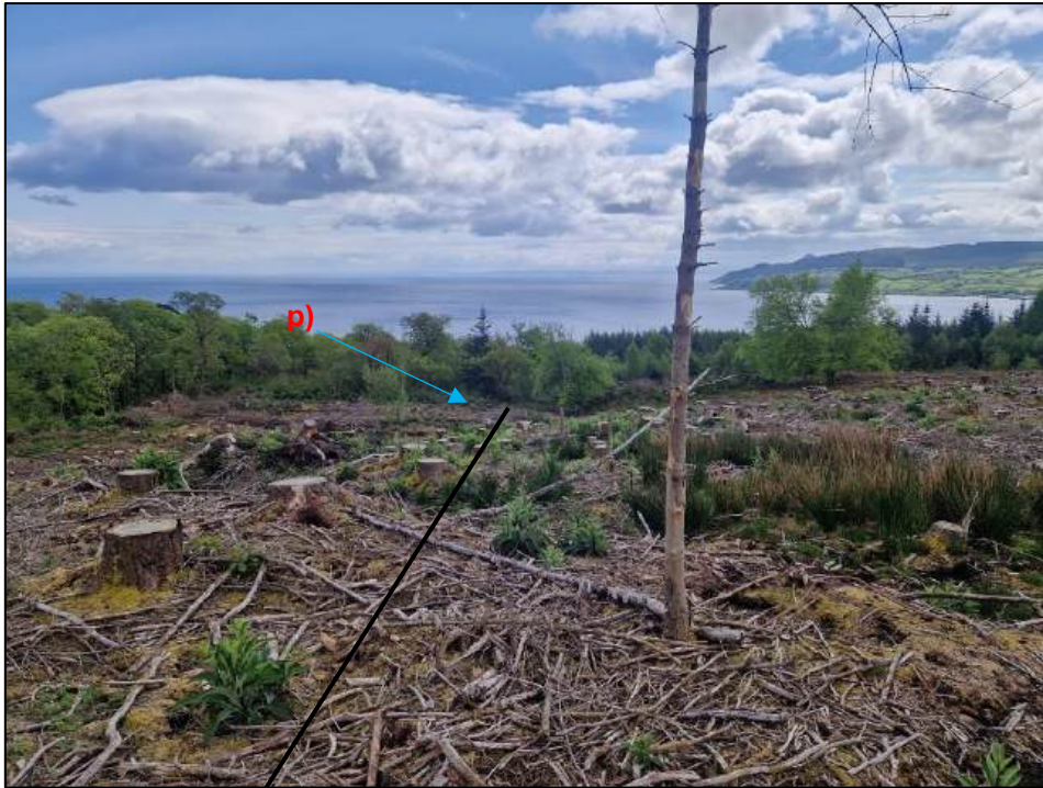
Figure 21 – view down penstock. Route was previously an ATV track/forestry ride.