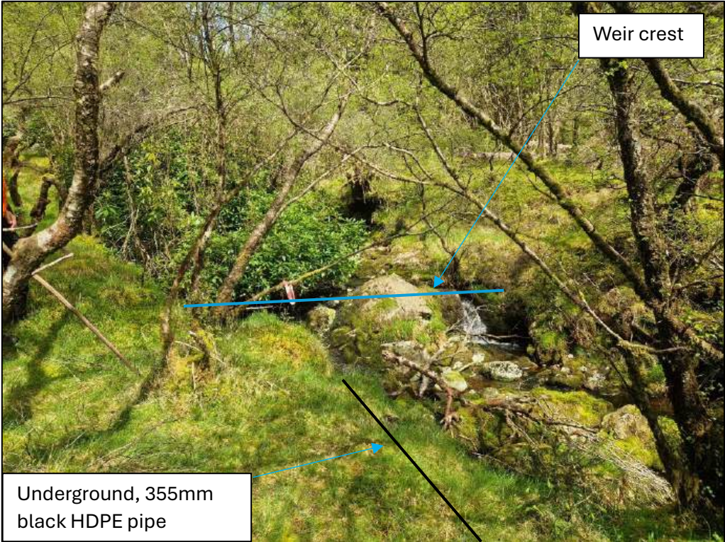
Figure 1 - Water Intake