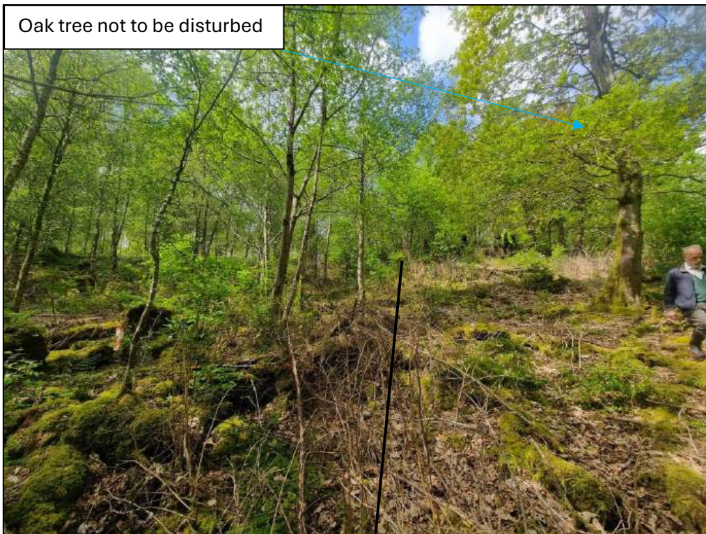
Figure 30 – view up penstock from powerhouse location