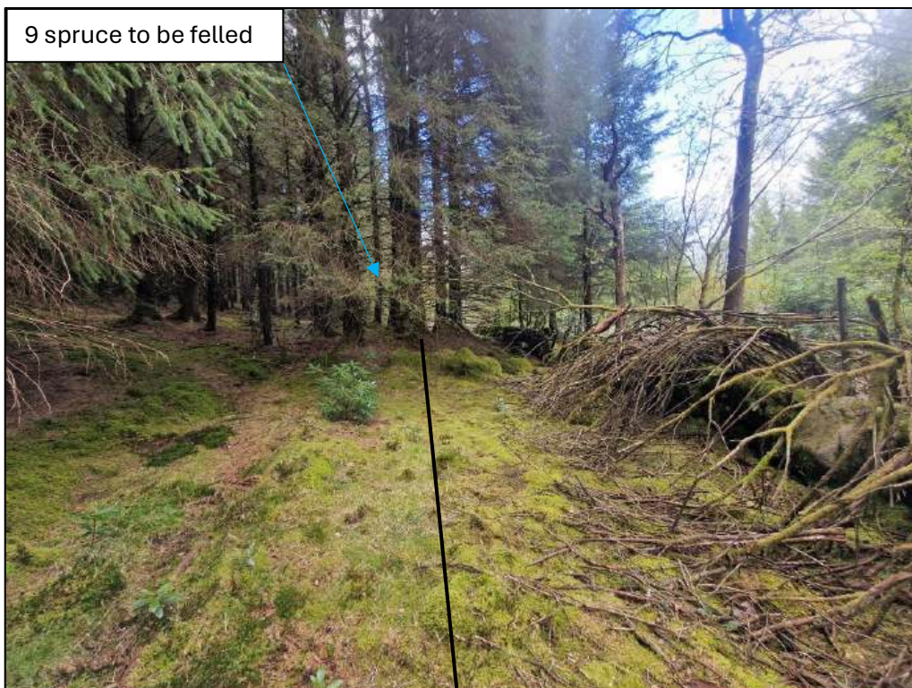
Figure 10 – view up penstock – penstock follows plantation ride