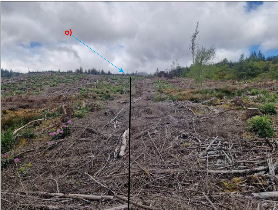
Figure 22 – view up penstock. Route was previously an ATV track/forestry ride.