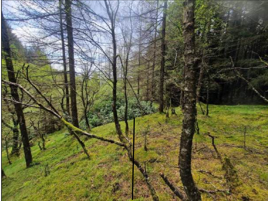
Figure 3 - View down penstock route – riparian area planted with larch, now diseased or dead