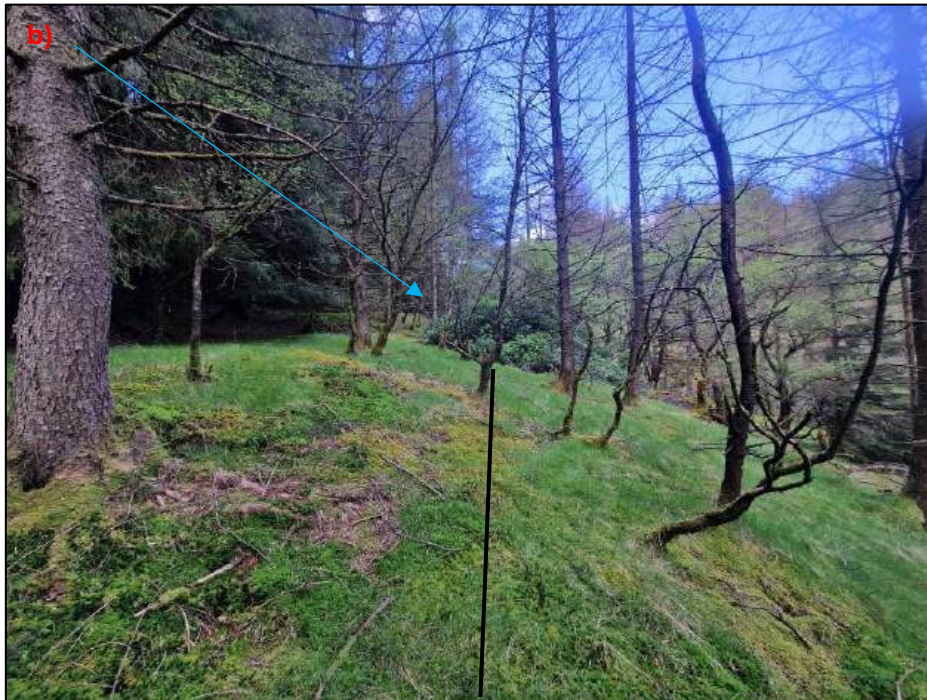
Figure 4 - View up penstock route – riparian area planted with larch, now diseased or dead