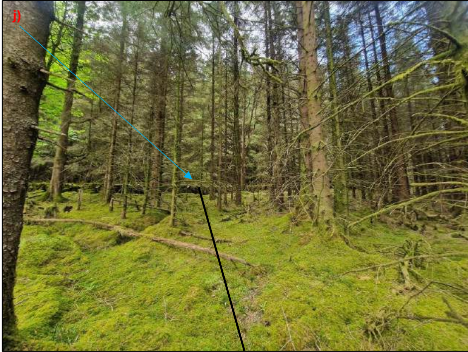
Figure 13 – view up penstock