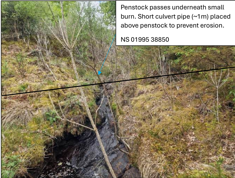
Figure 23 – New culvert at NS 01995 38850. Penstock still within ATV track