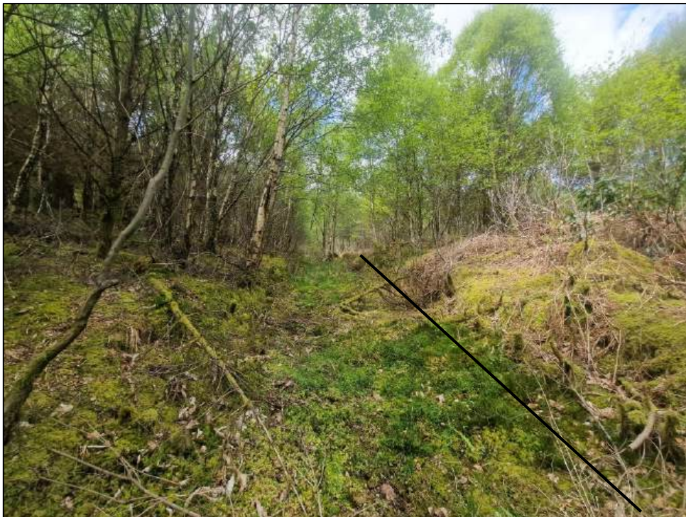
Figure 28 – view up penstock along overgrown track