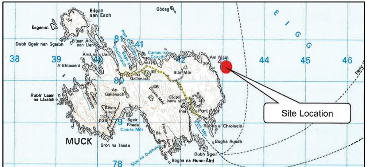
Figure 1 Fish Pen Location